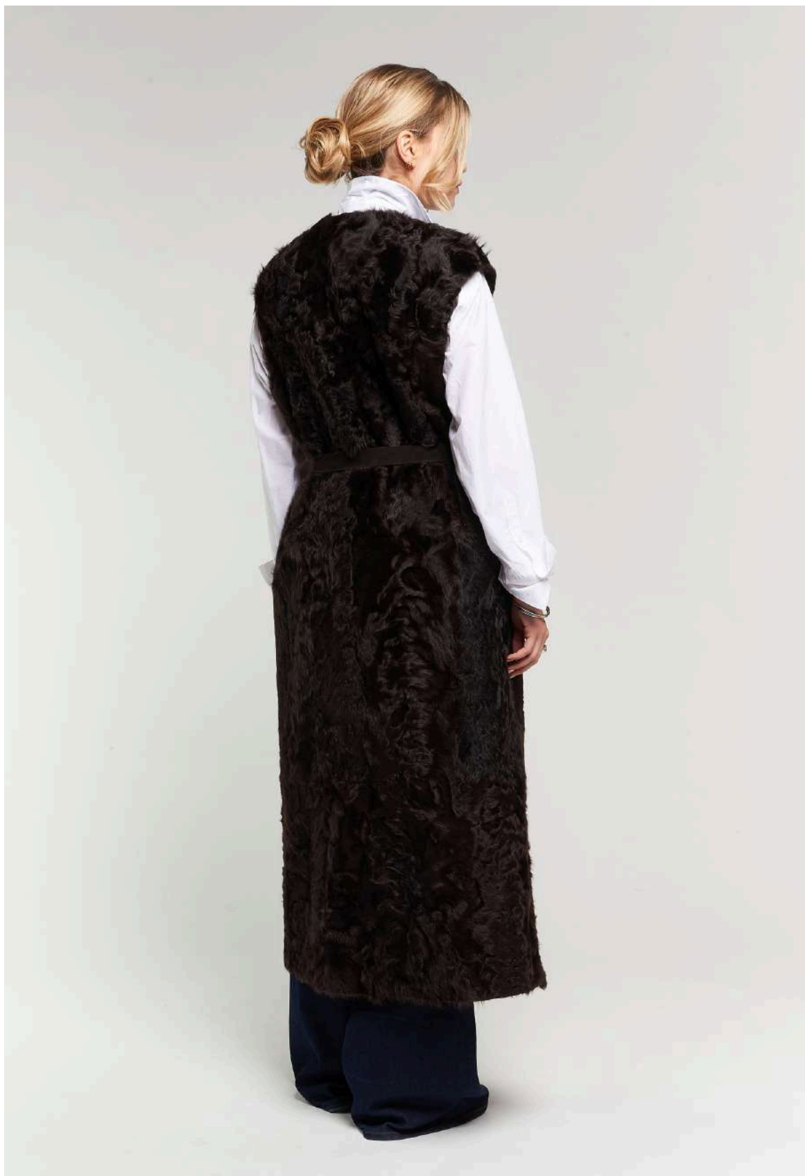
Brown Xiangao vest