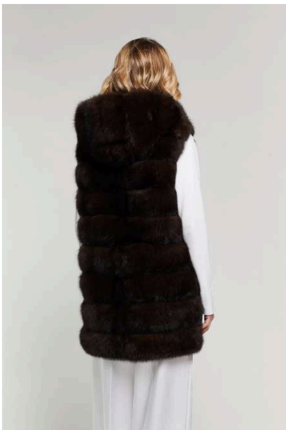
Extra Dark Russian Sable vest Horizontal motif with hood