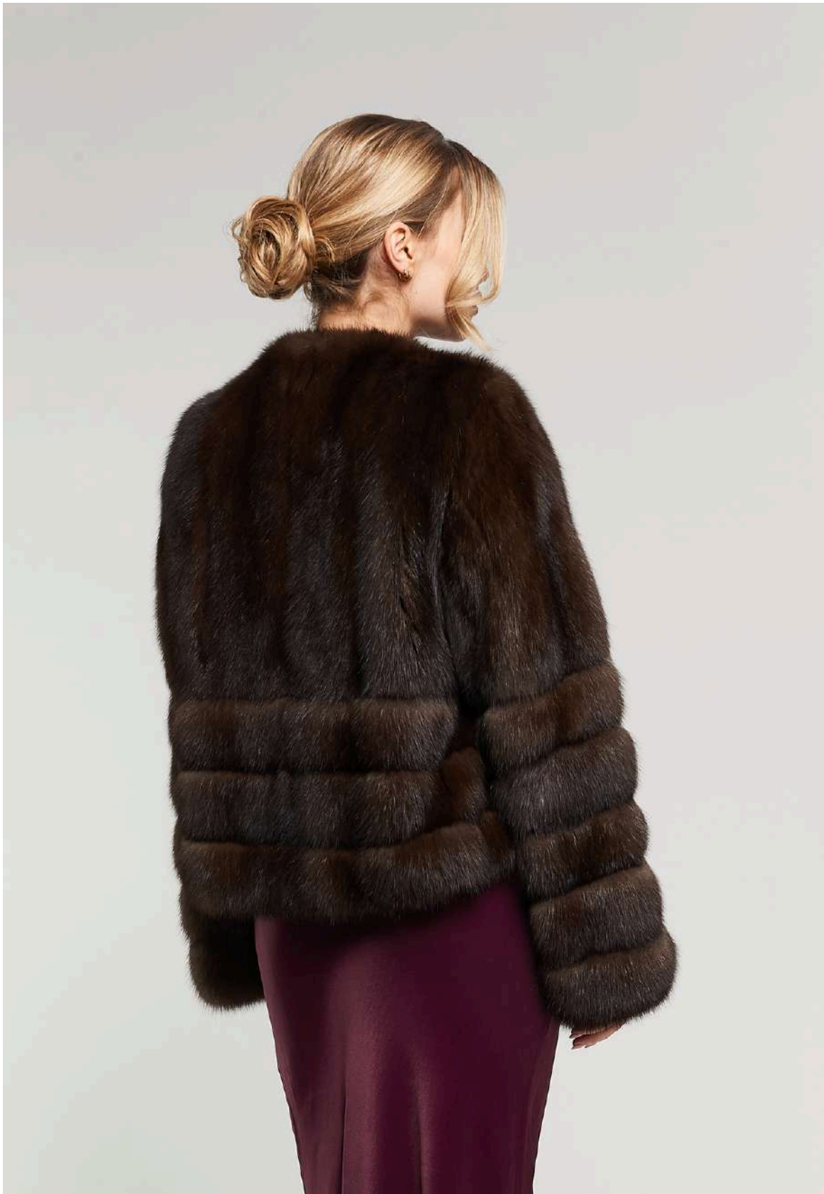
Dark Russian Sable jacket Vertical and Horizontal motif