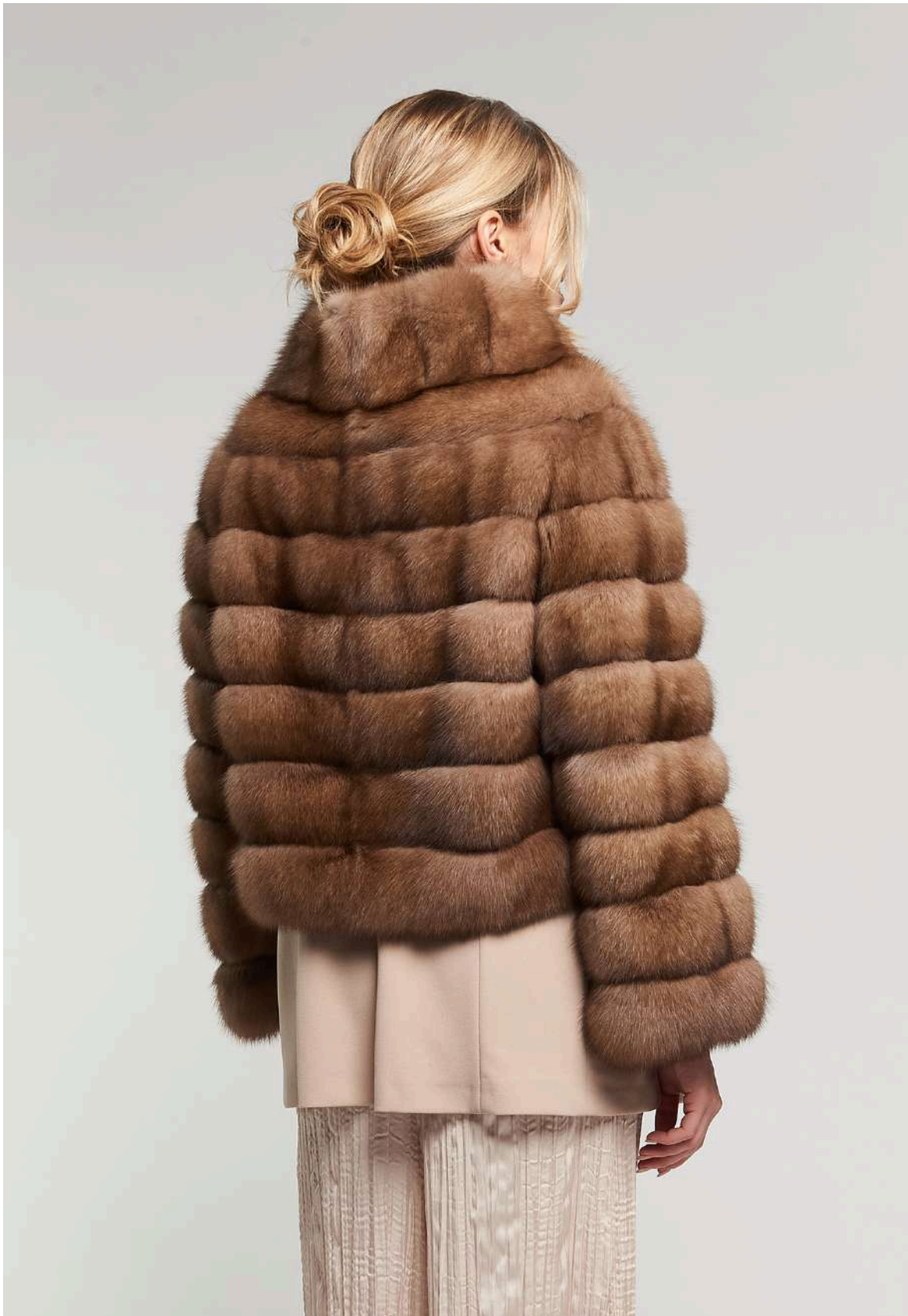
Lavender Russian Sable jacket Horizontal motif