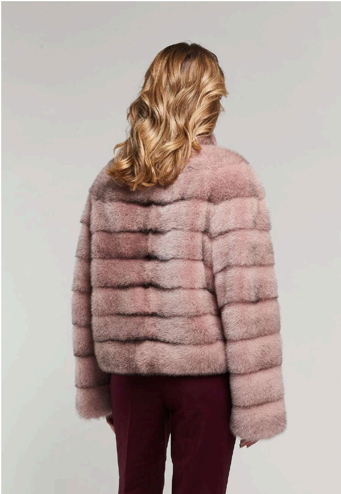
Pink Mink jacket Horizontal motif