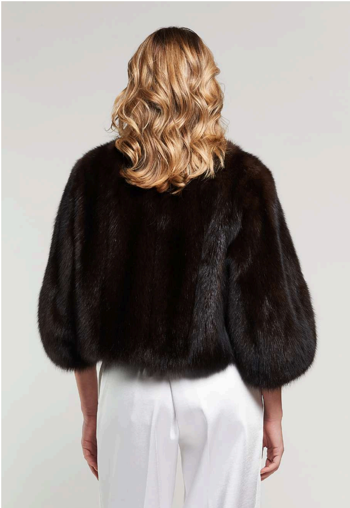
Dark Russian Sable jacket Vertical full skin motif