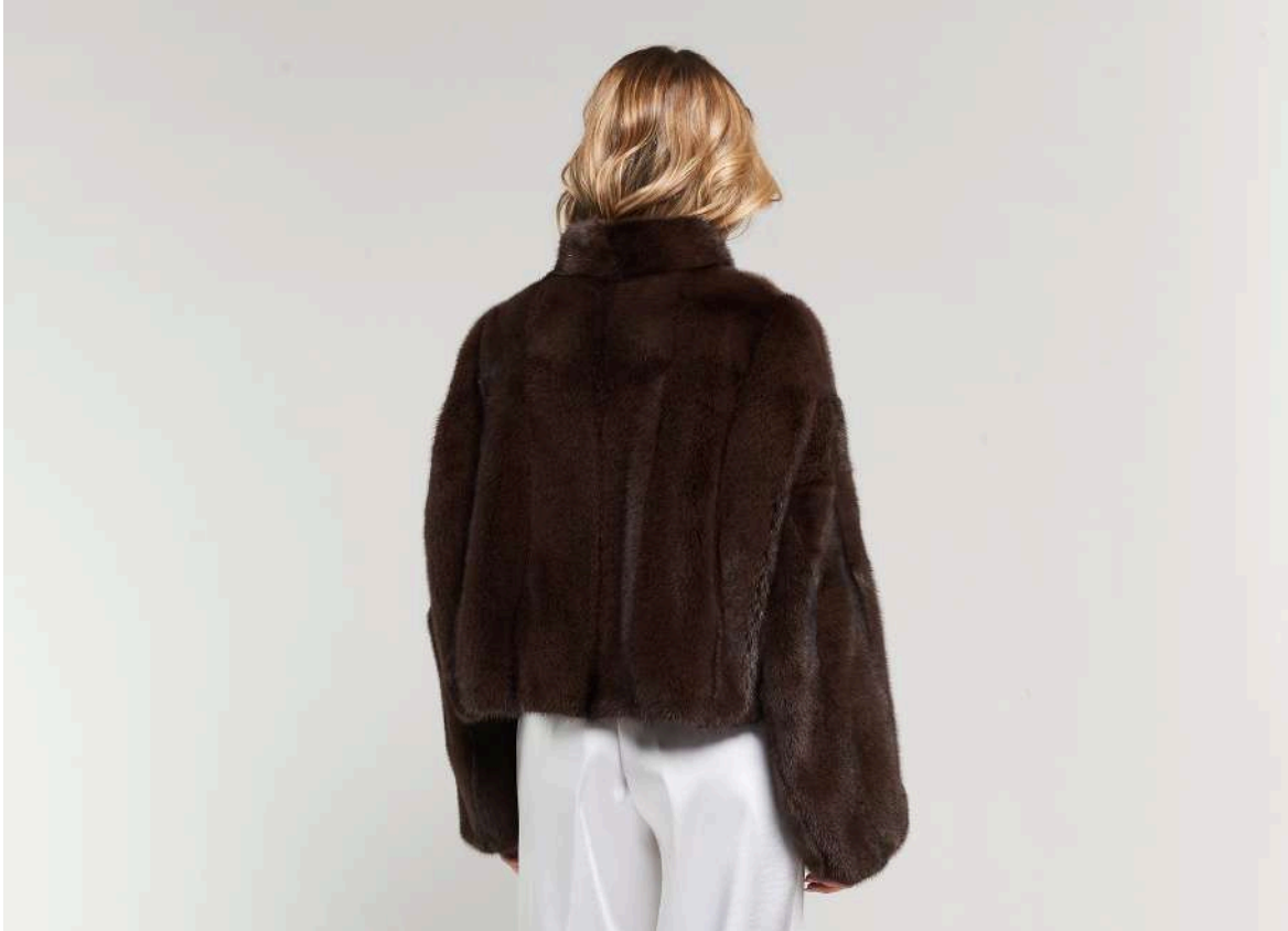
Brown Mink jacket Vertical motif