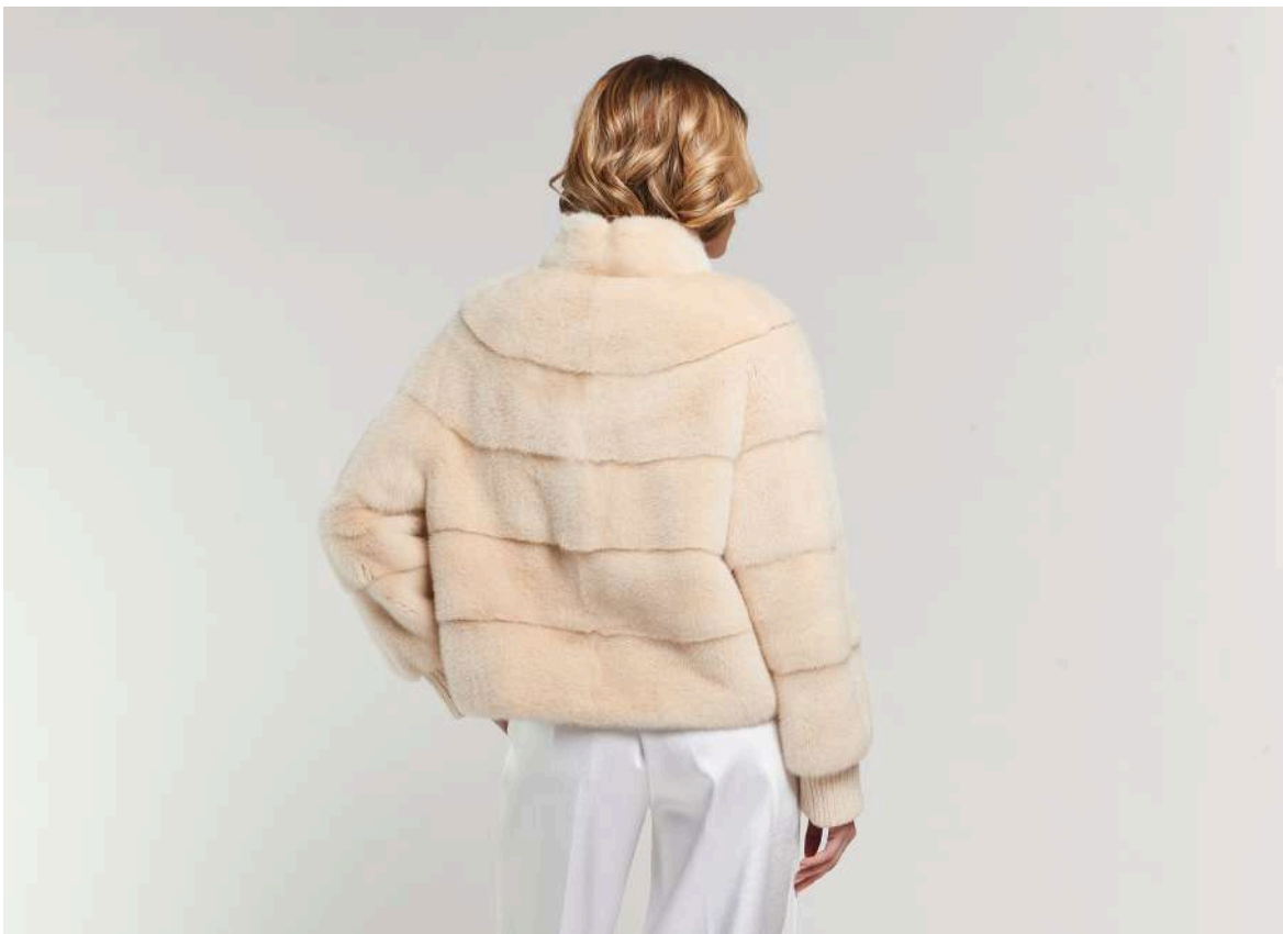
Milk Mink jacket Horizontal motif