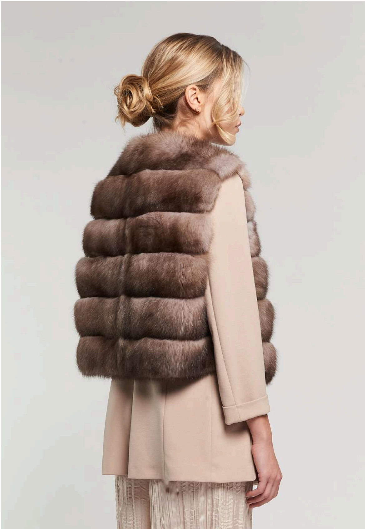
Lavender Russian Sable vest Horizontal motif