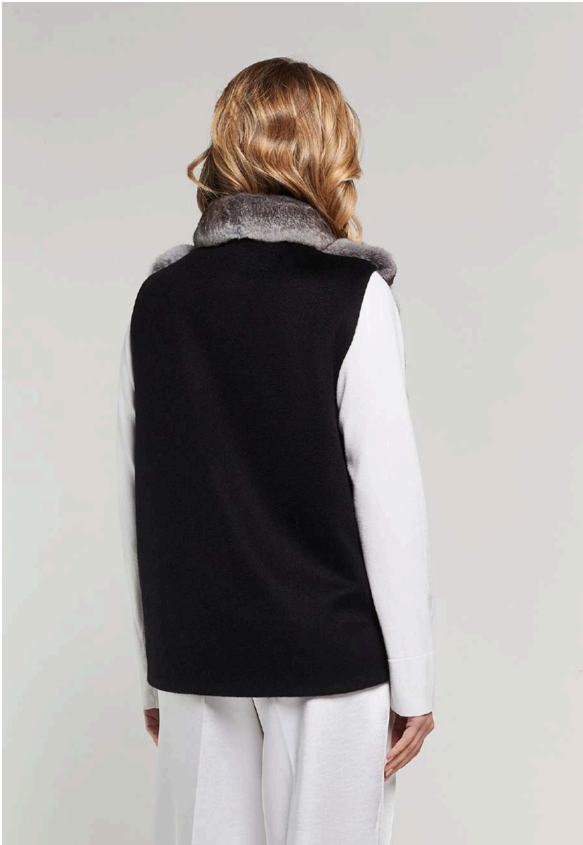
Chinchilla vest Horizontal motif with Cashmere on the back