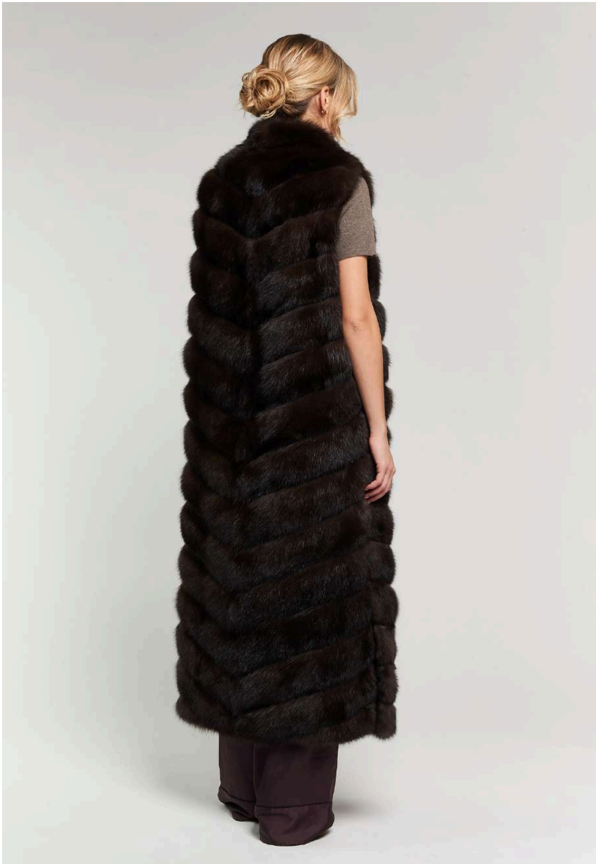
Dark Russian Sable vest Diagonal motif