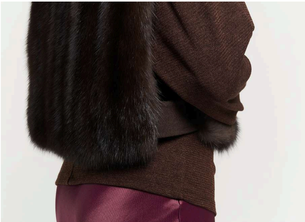
Dark Russian Sable vest Vertical full skin motif