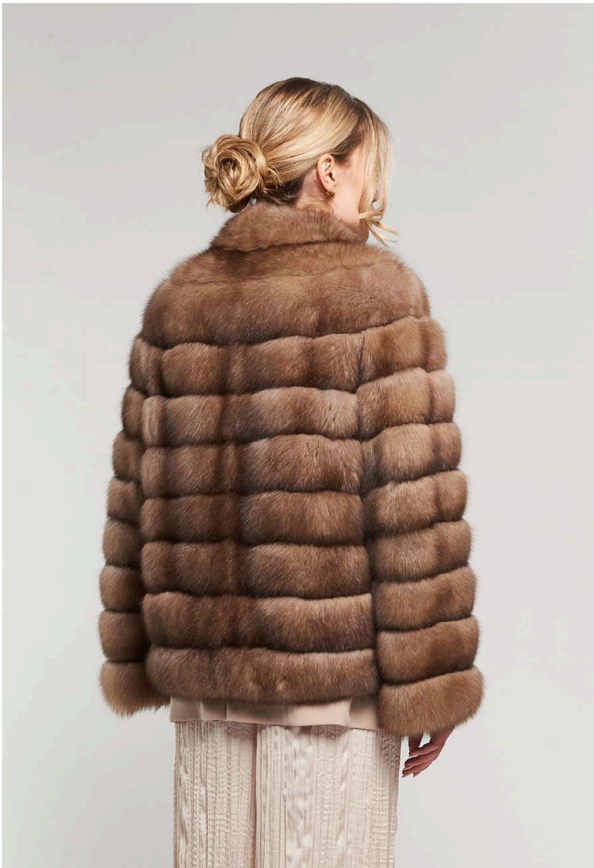
Lavender Silvery Russian Sable jacket Horizontal motif