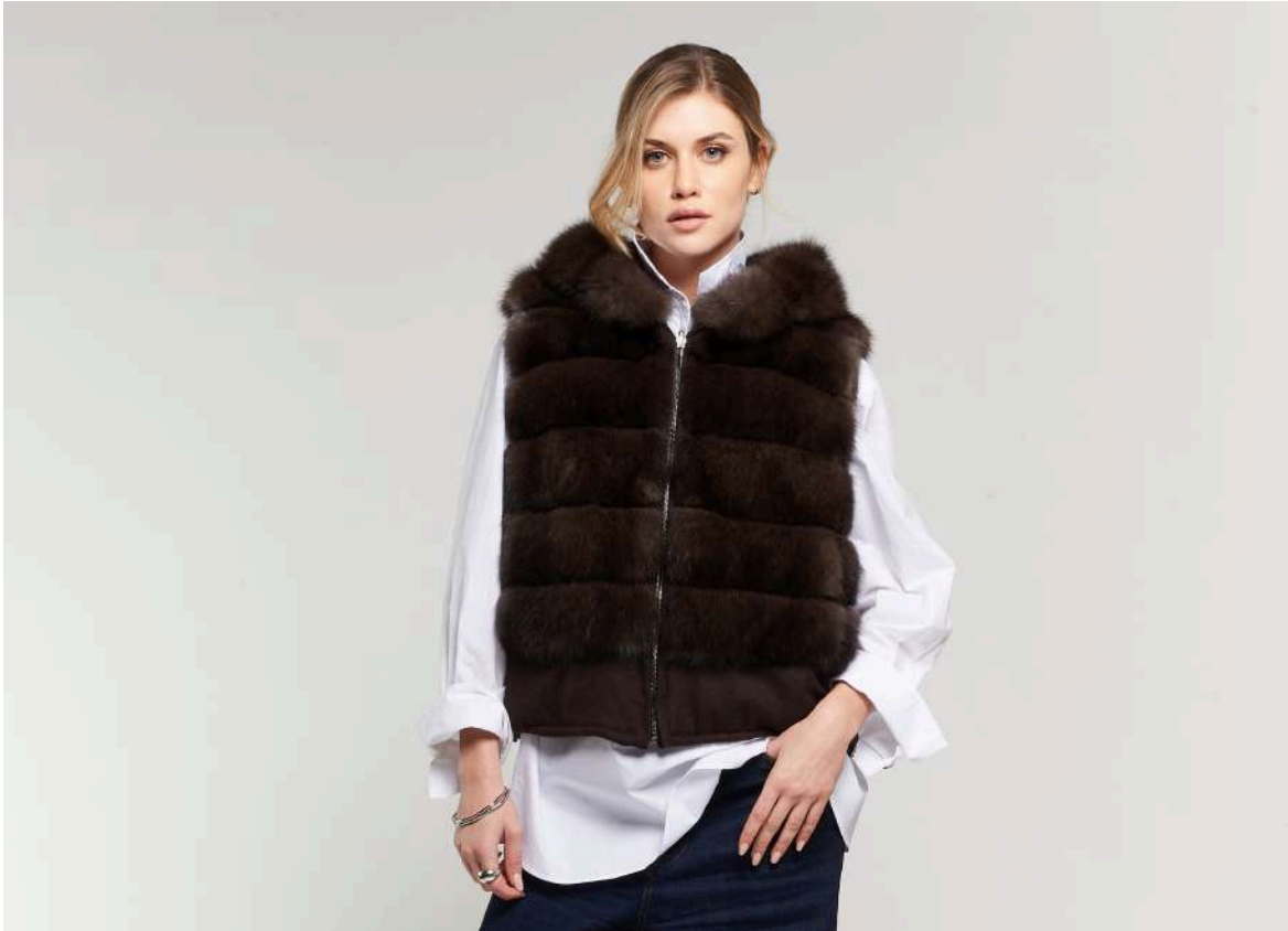
Antracite Silvery Russian Sable vest Horizontal motif with hood Reversible in cashmere