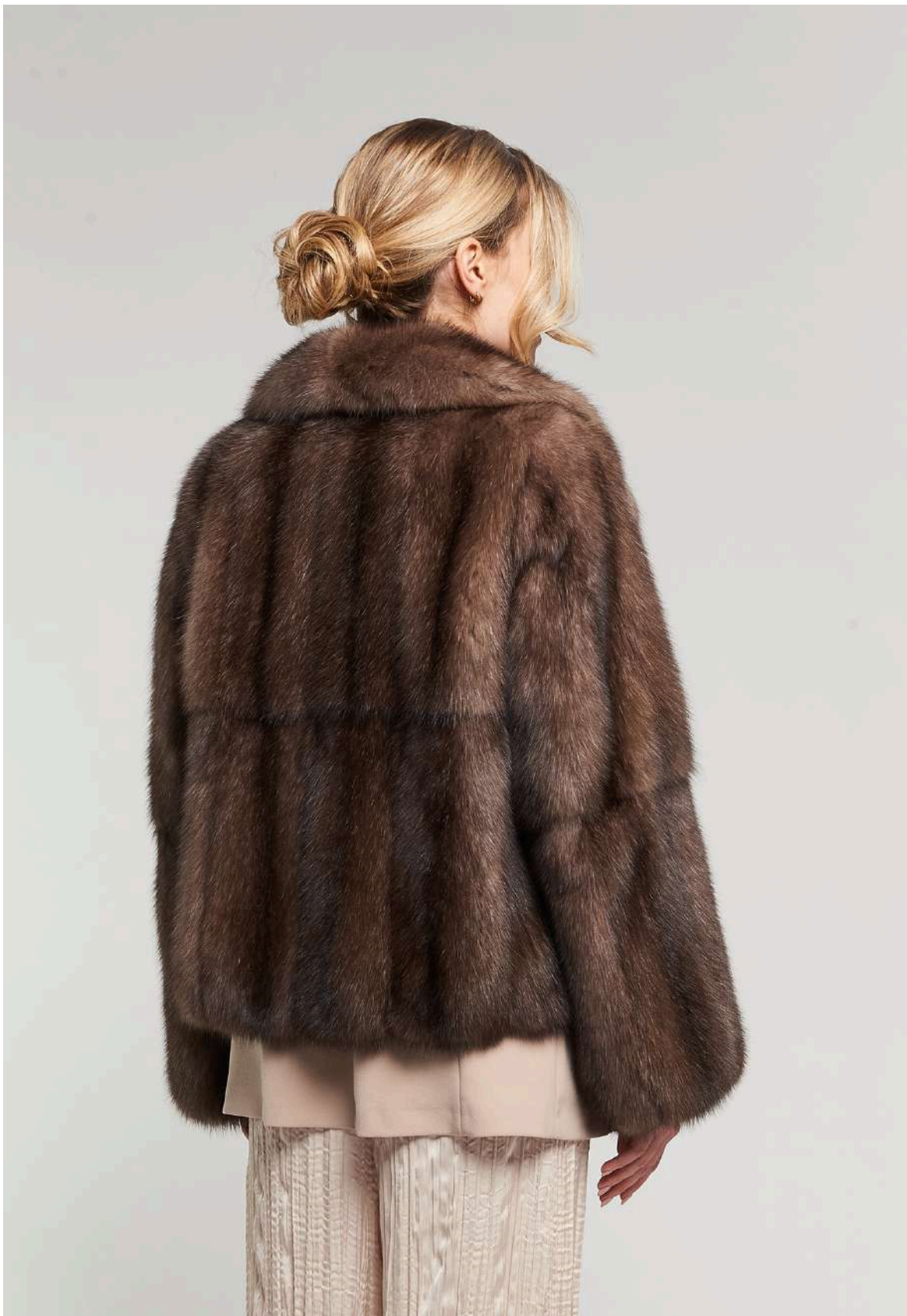
Tortora Silvery Russian Sable jacket Full skin vertical motif