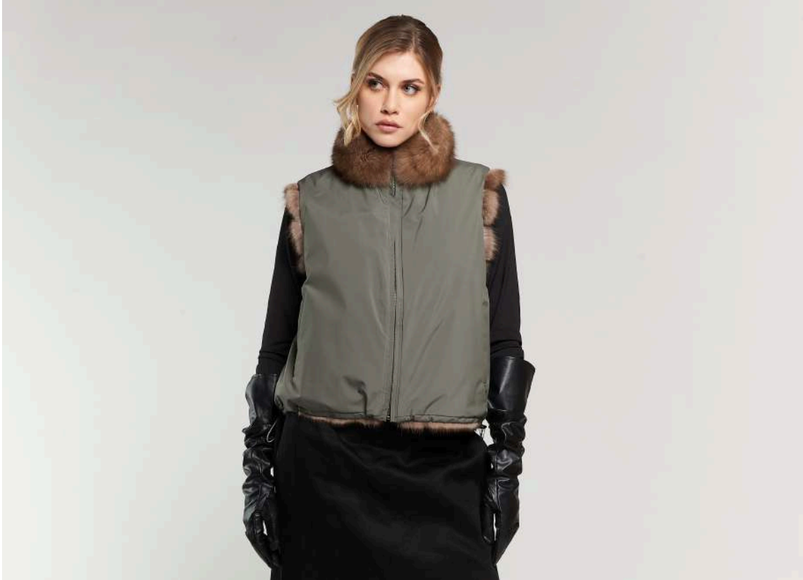
Reversible vest Lavender Russian Sable Horizontal motif