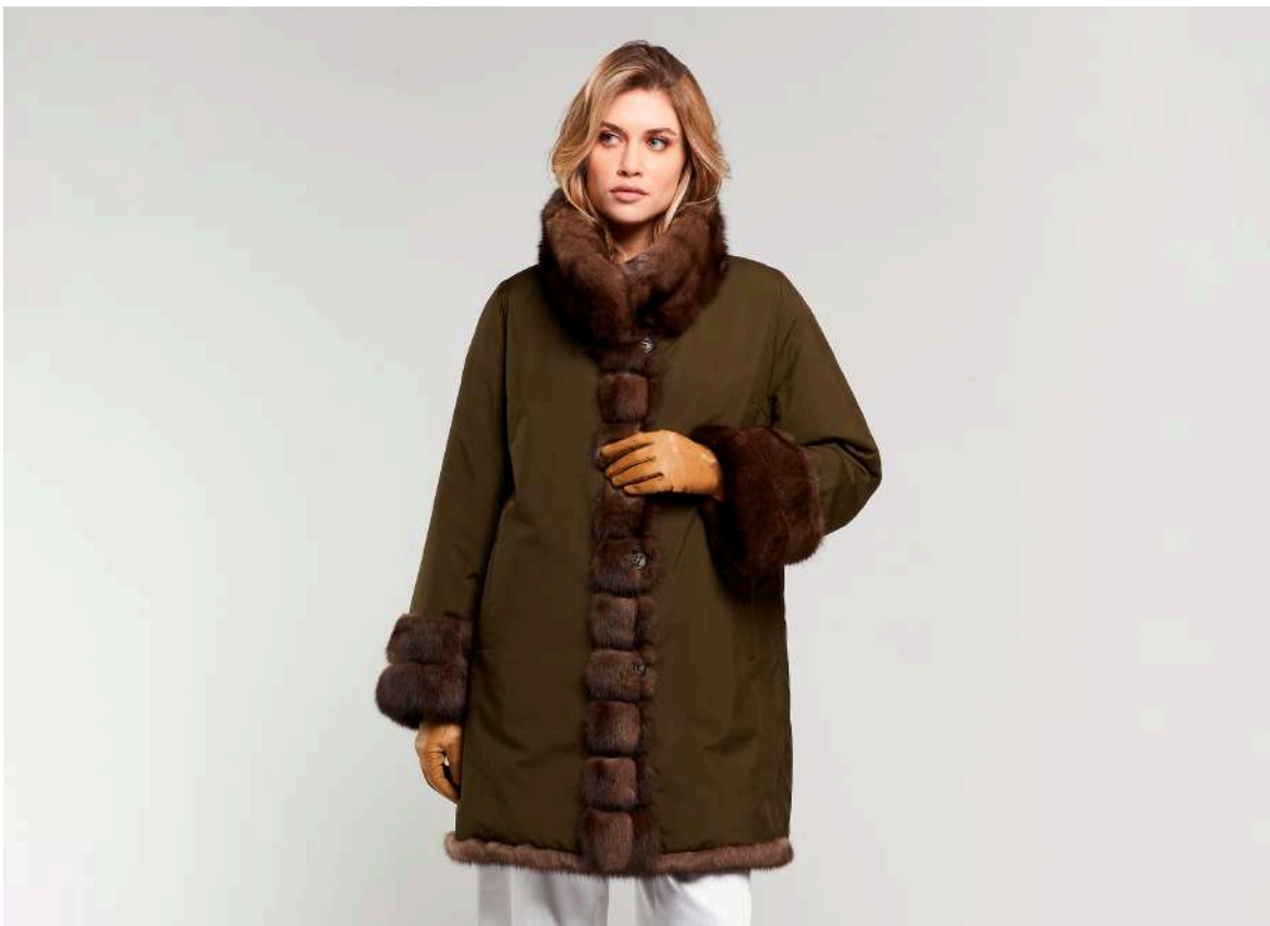
Reversible jacket Dark Russian Sable Horizontal motif