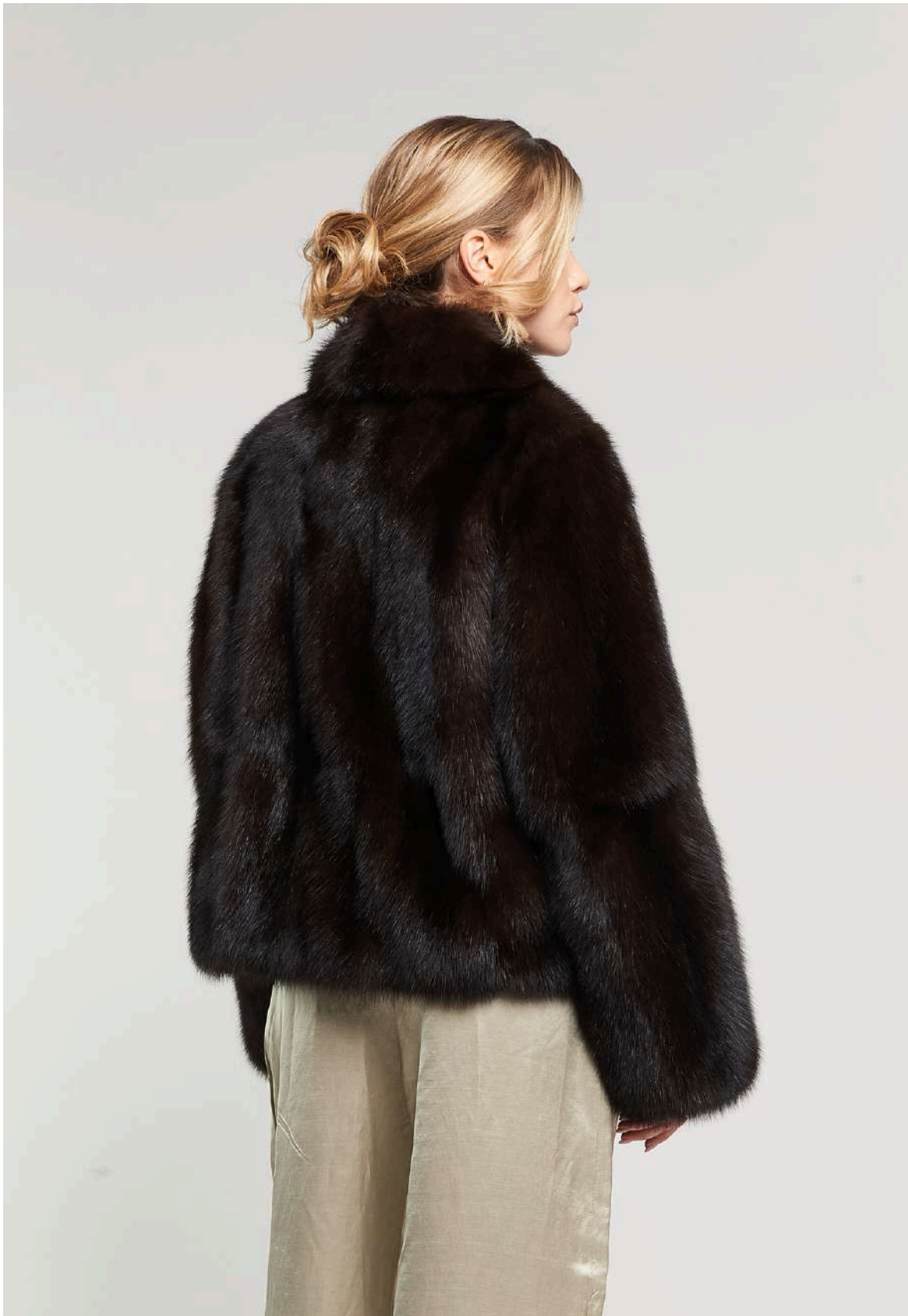
Dark Russian Sable jacket Vertical full skin motif