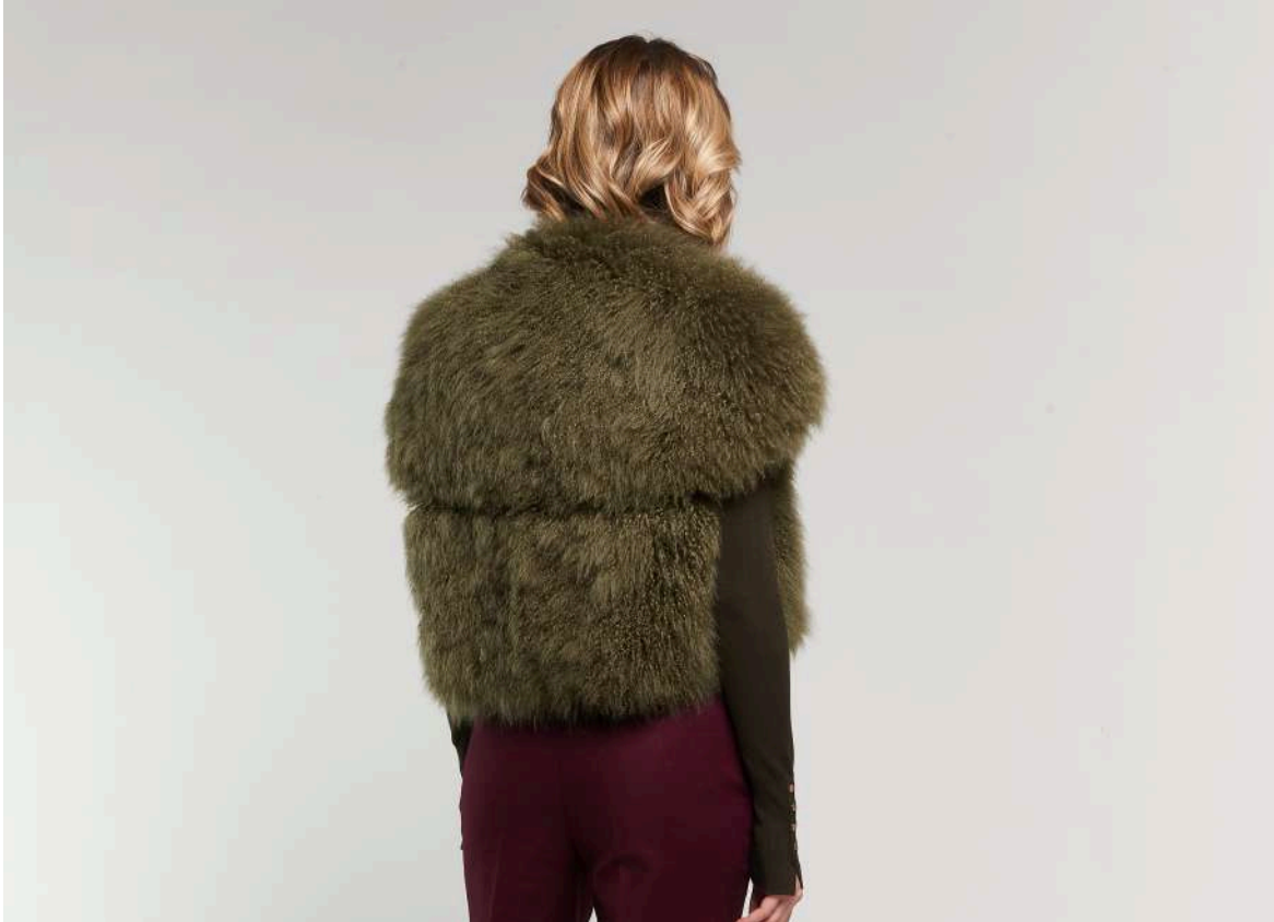
Green Cashmere Lamb vest