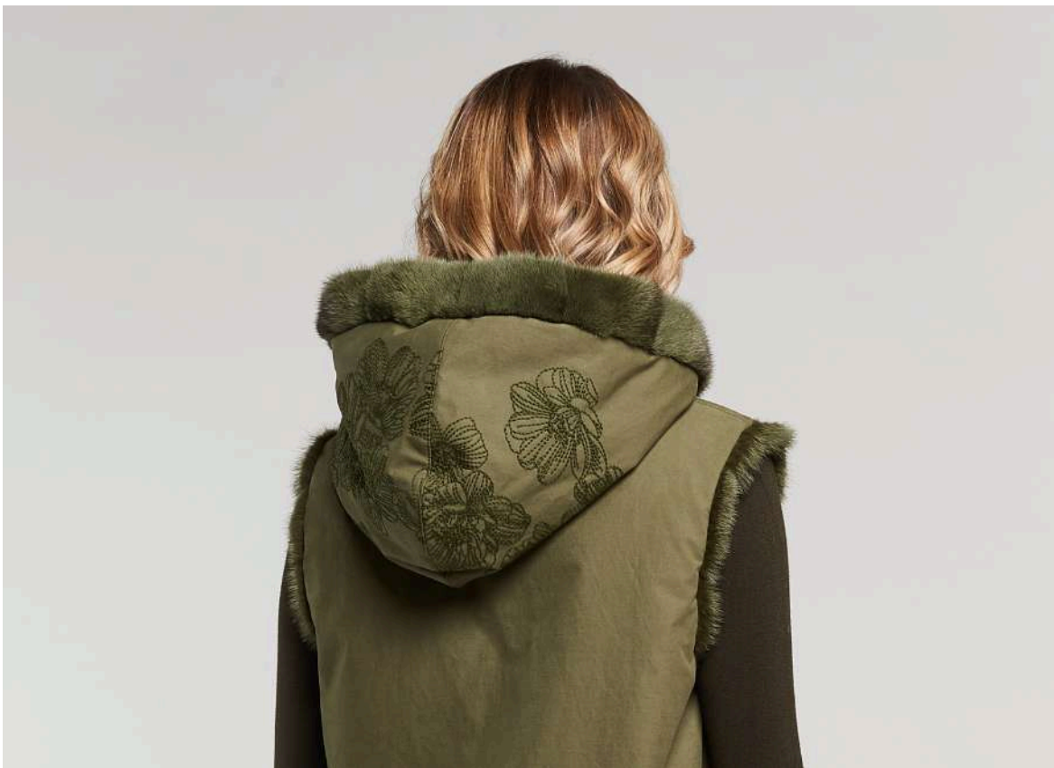
Reversible hooded vest Green Mink Horizontal motif