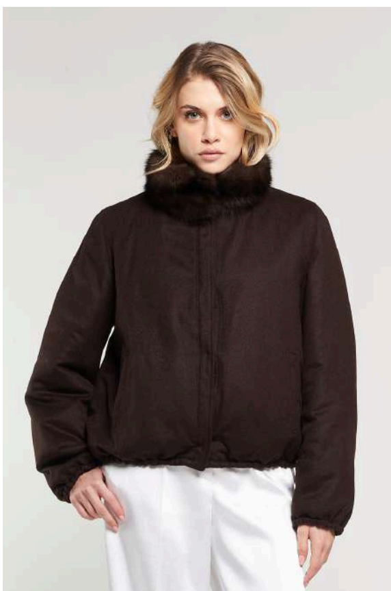
Antracite Silvery Russian Sable jacket Horizontal motif Reversible in cashmere