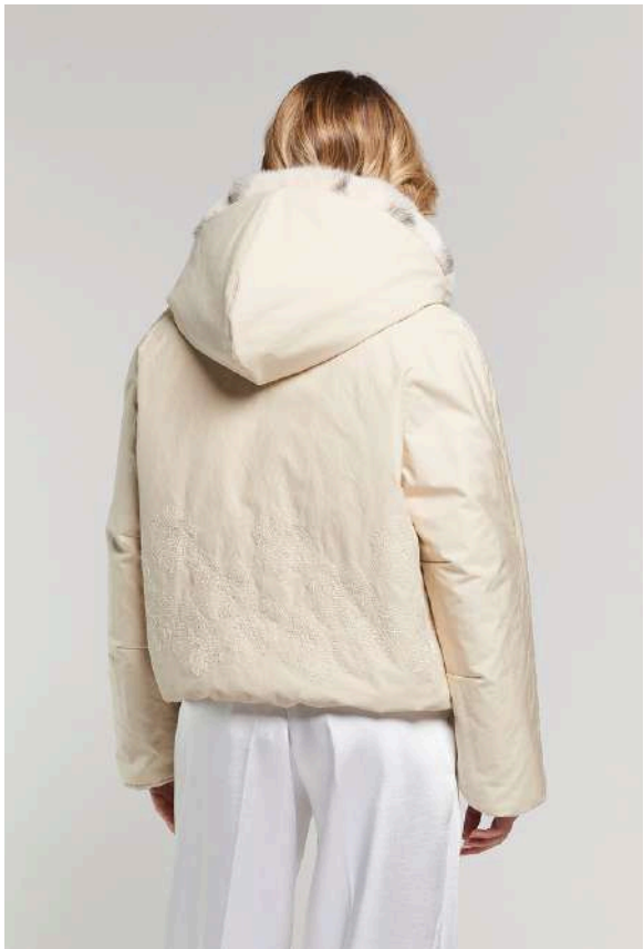
Reversible hooded jacket Milk Mink Horizontal motif