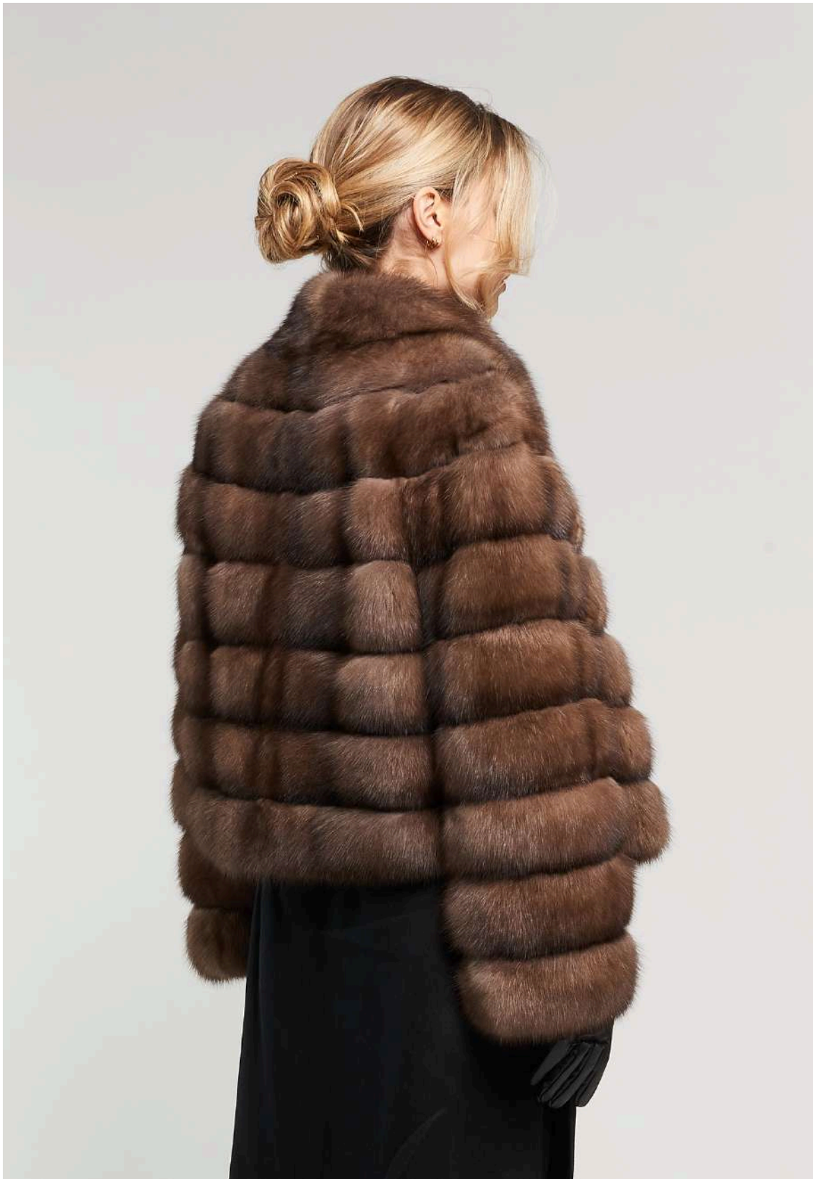
Tortora Grey Russian Sable jacket Horizontal motif