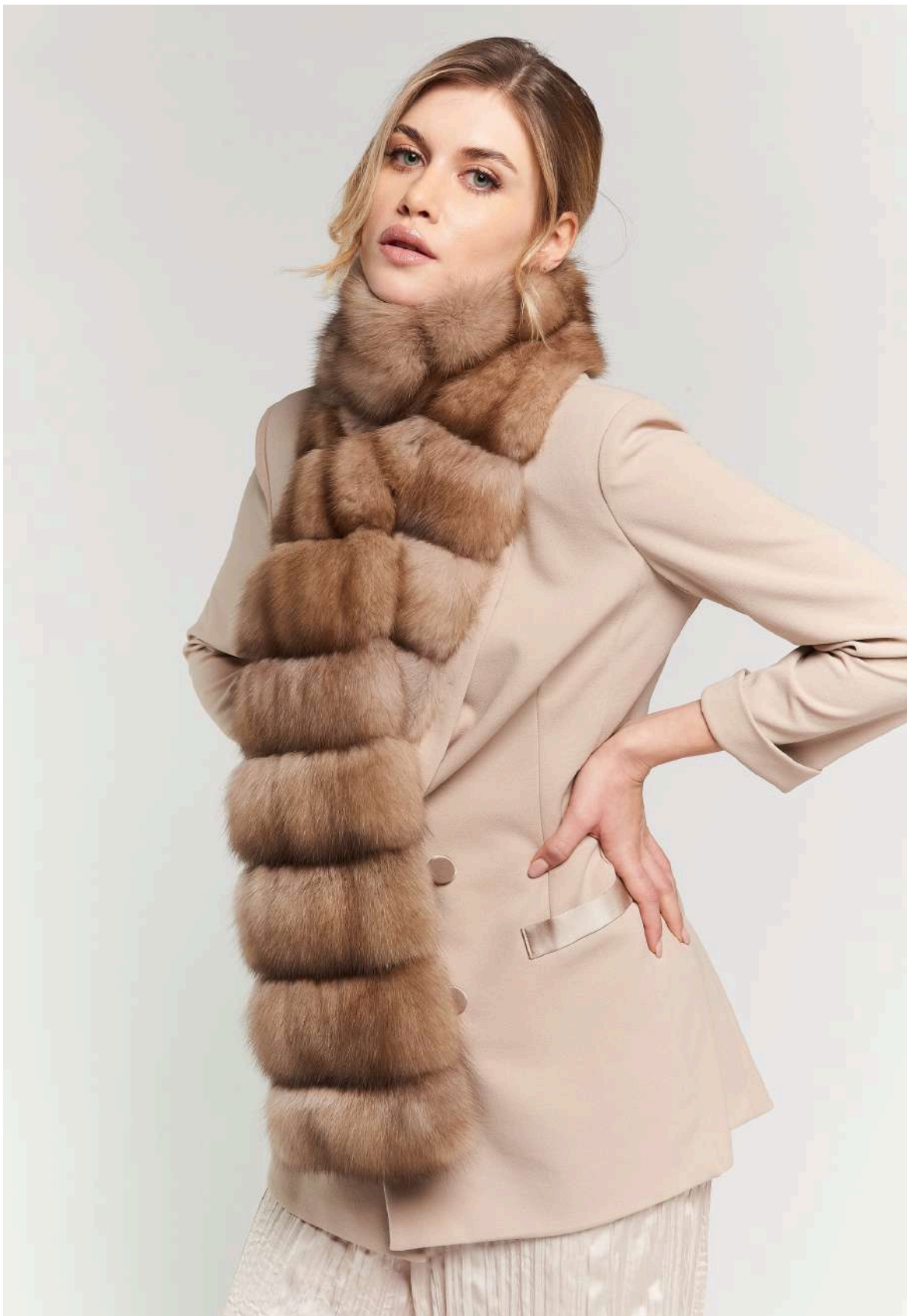
Russian Sable scarf with Cashmere