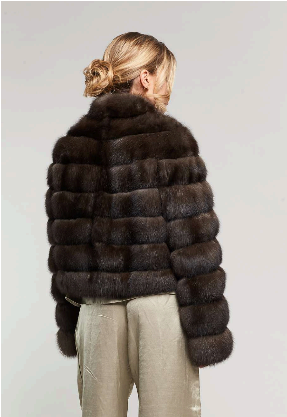
Antracite Russian Sable jacket Horizontal motif