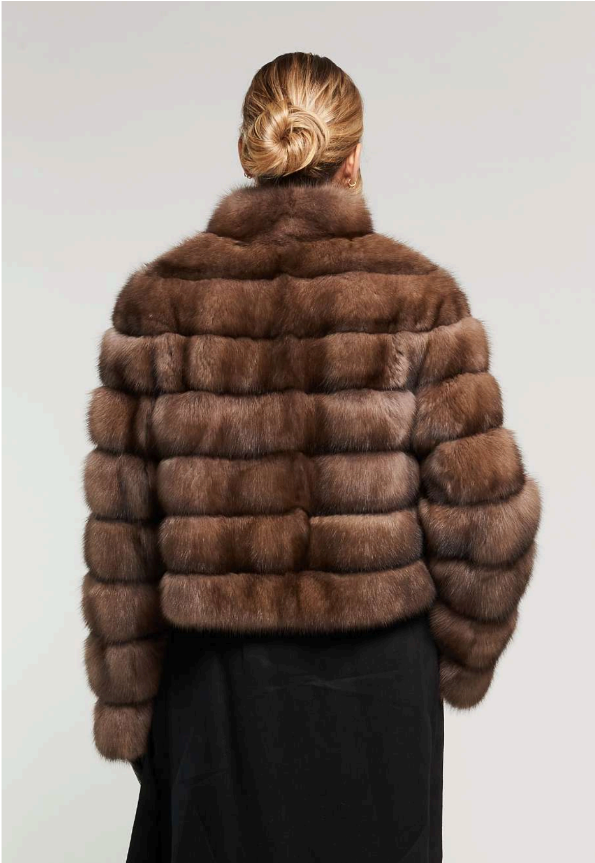
Tortora Grey Russian Sable jacket Horizontal motif