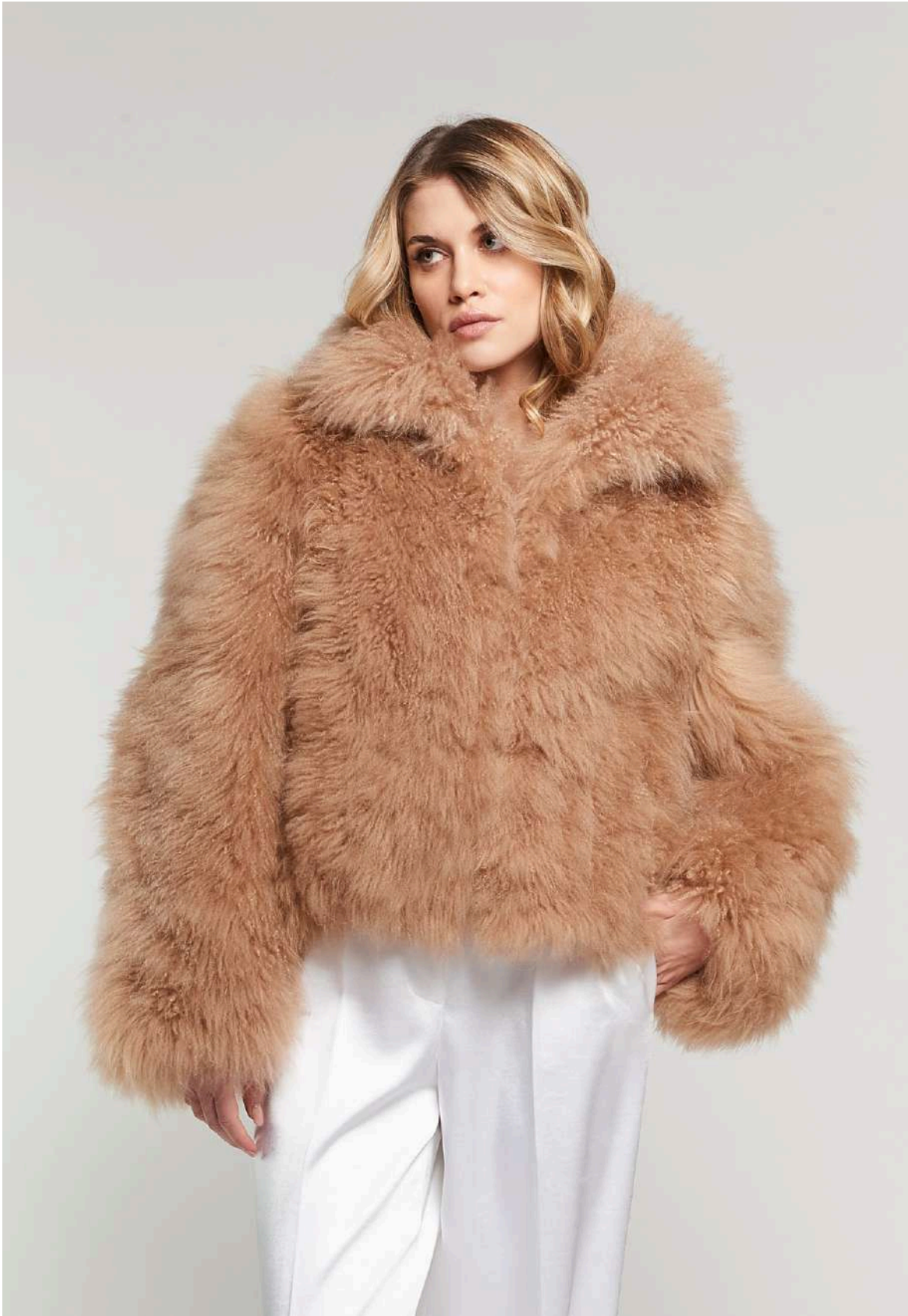
Camel Cashmere Lamb jacket