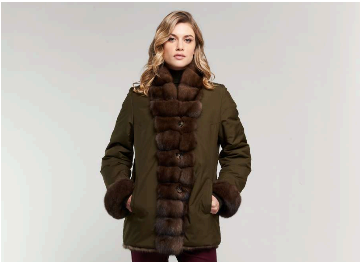
Reversible jacket Dark Russian Sable Horizontal motif