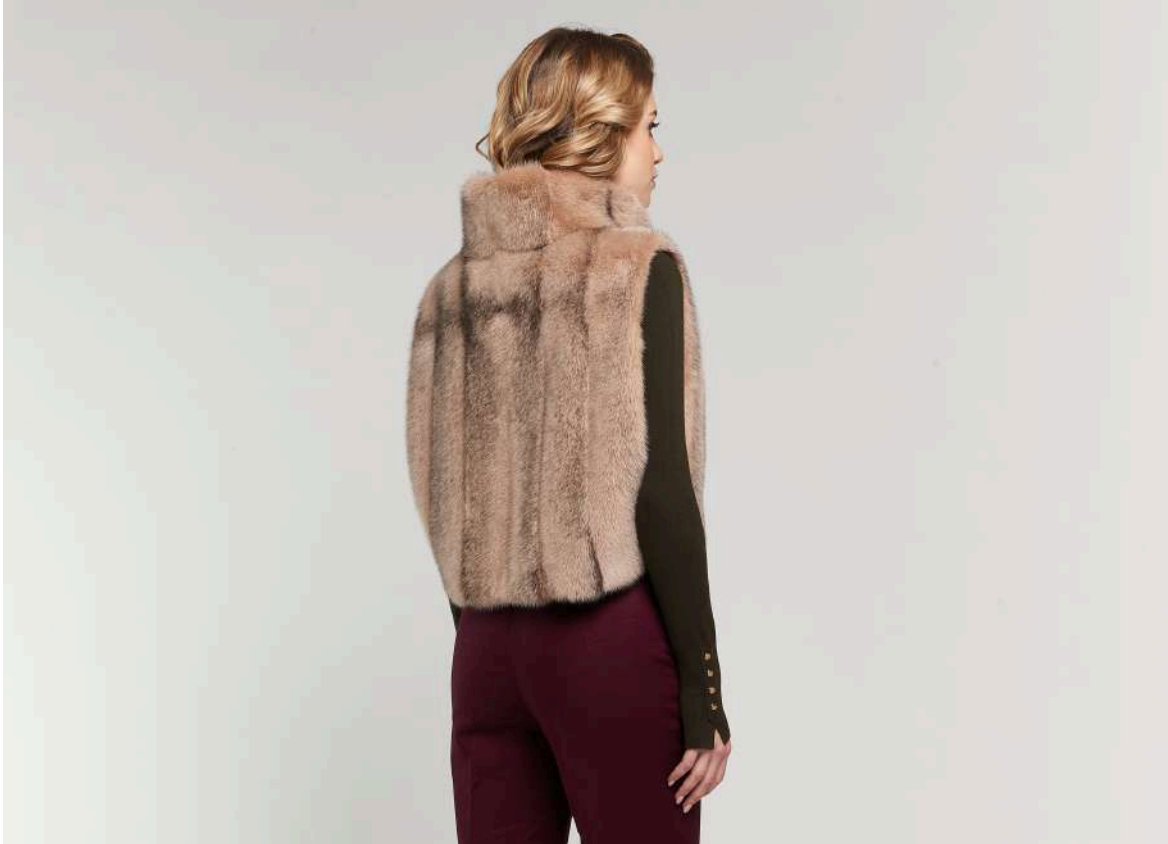
Camel Mink vest Vertical motif