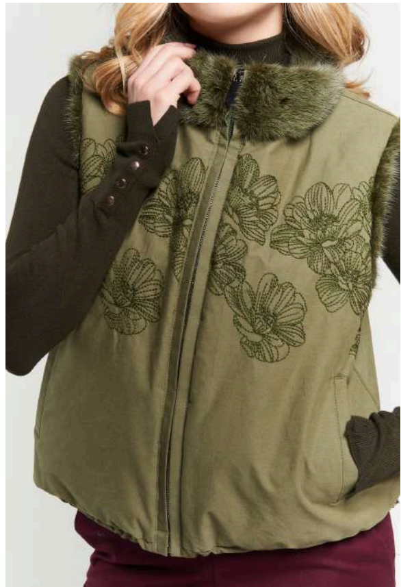
Reversible vest Green Mink Horizontal motif