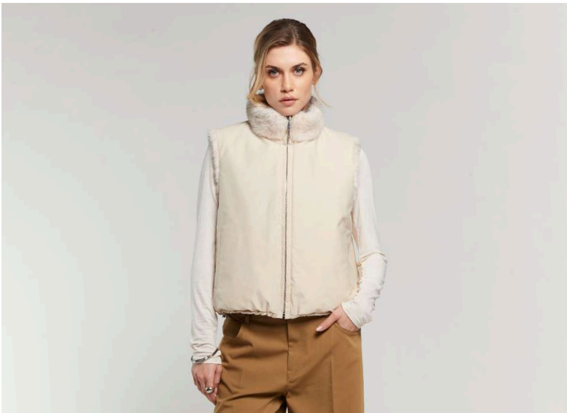
Reversible vest Milk Mink Horizontal motif