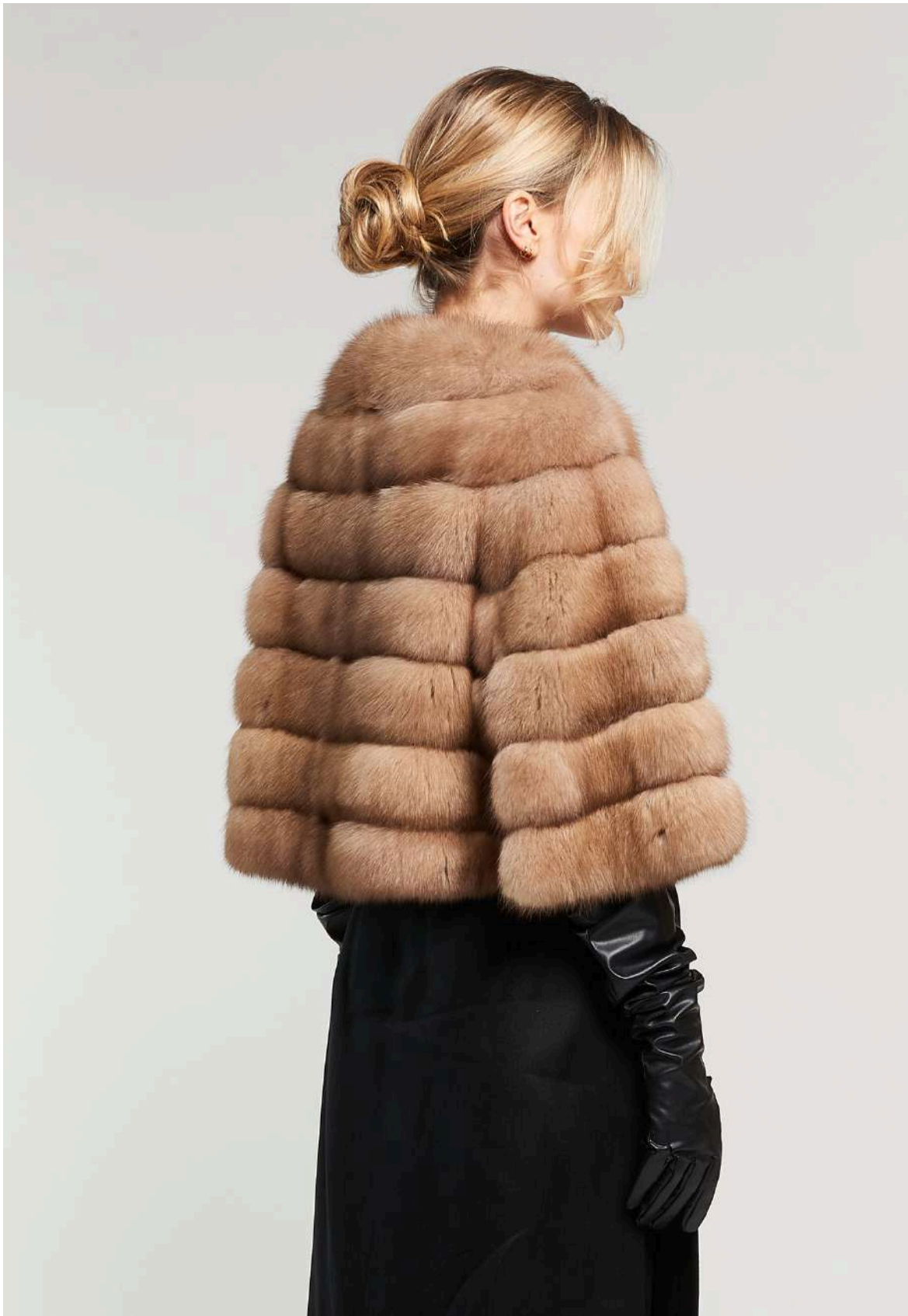
Tortora Russian Sable jacket Horizontal motif