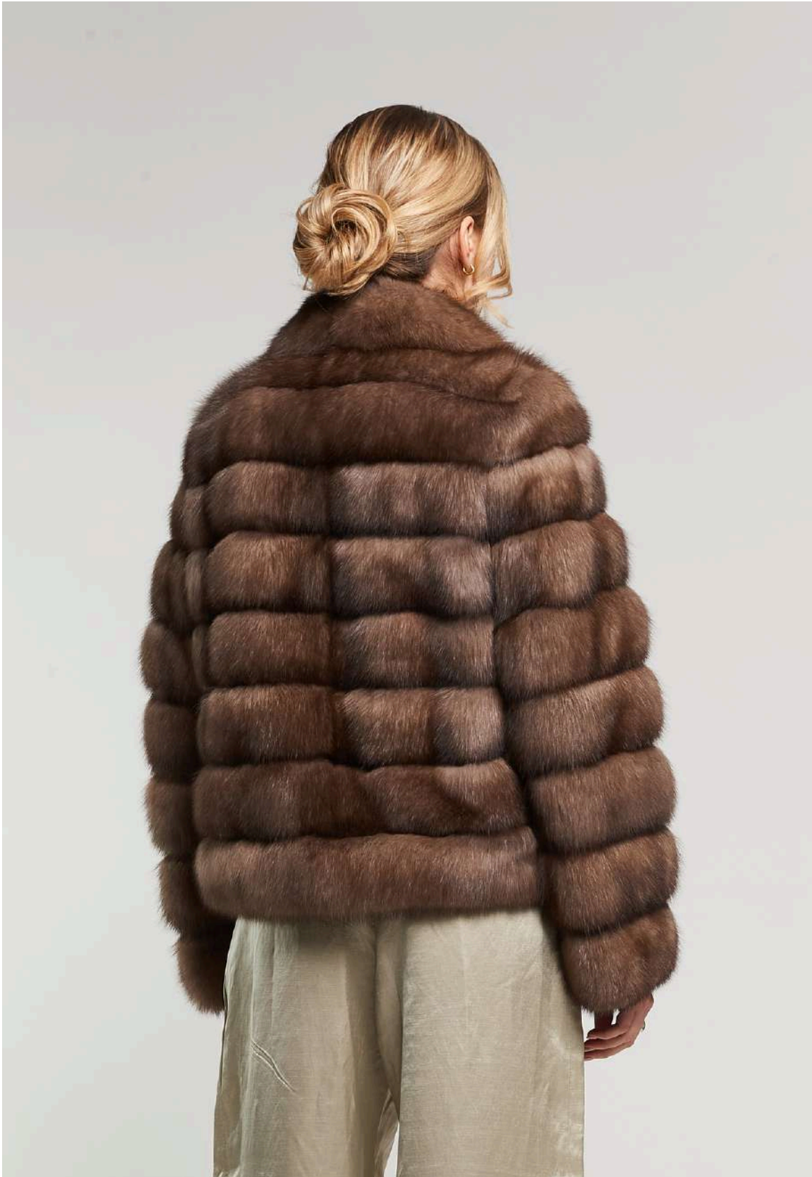
Tortora Grey Russian Sable jacket Horizontal motif