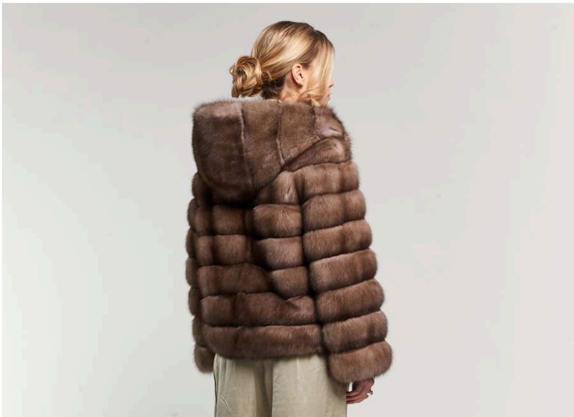
Lavender Russian Sable jacket Horizontal motif with hood