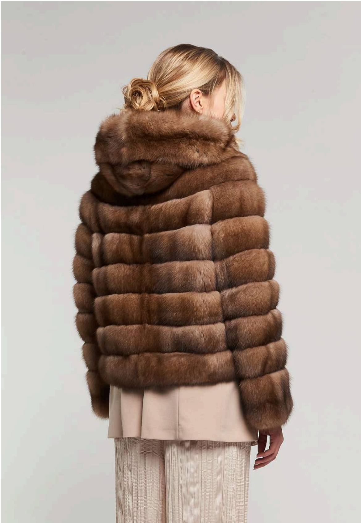
Lavender Canadian Sable jacket Horizontal motif with hood