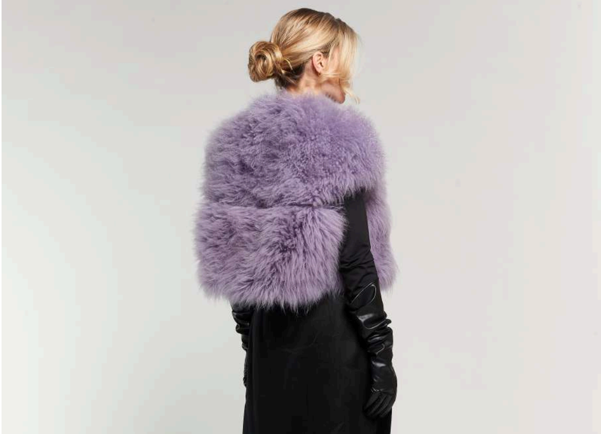
Purple Cashmere Lamb vest