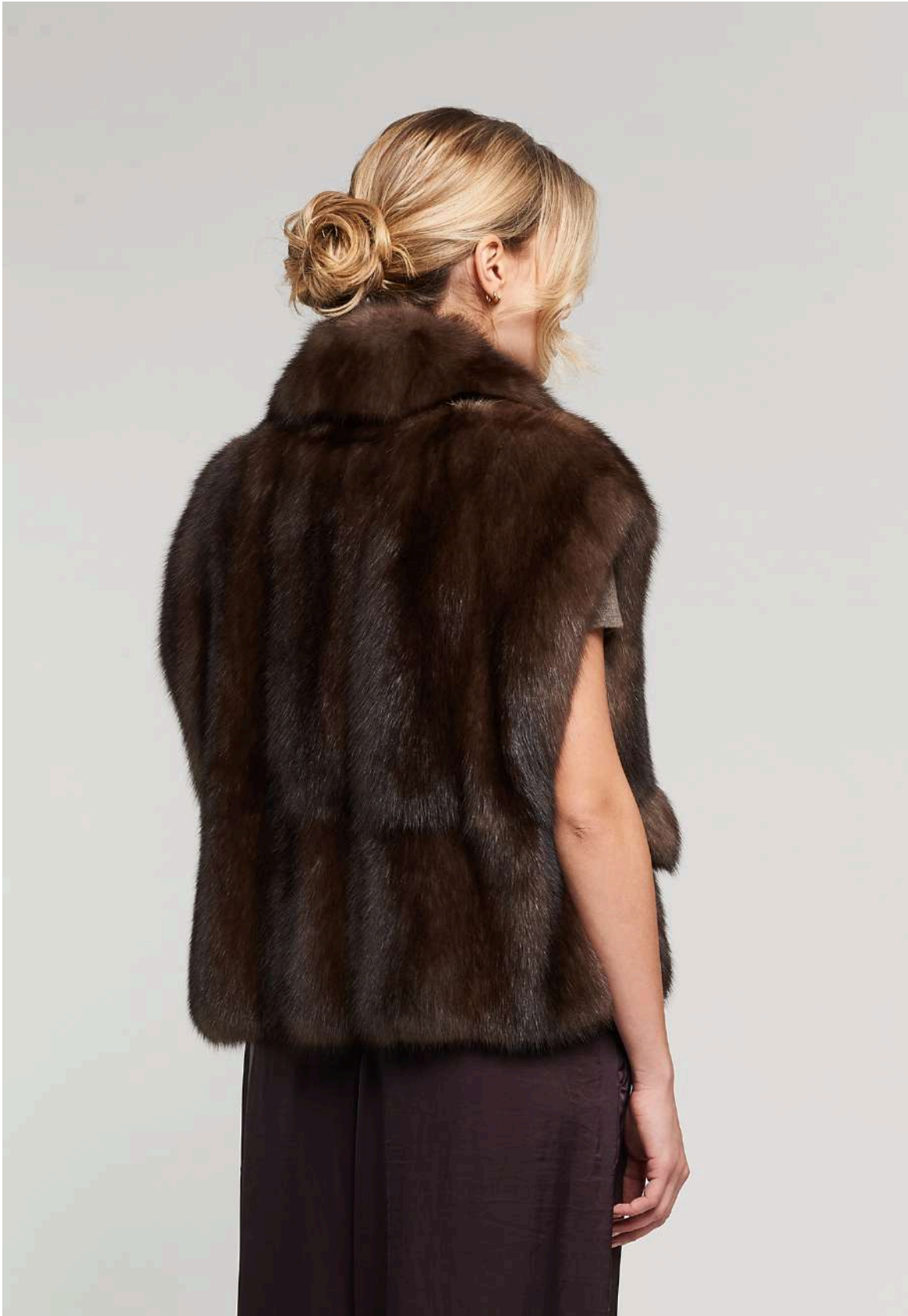
Dark Russian Sable vest Vertical full skin motif