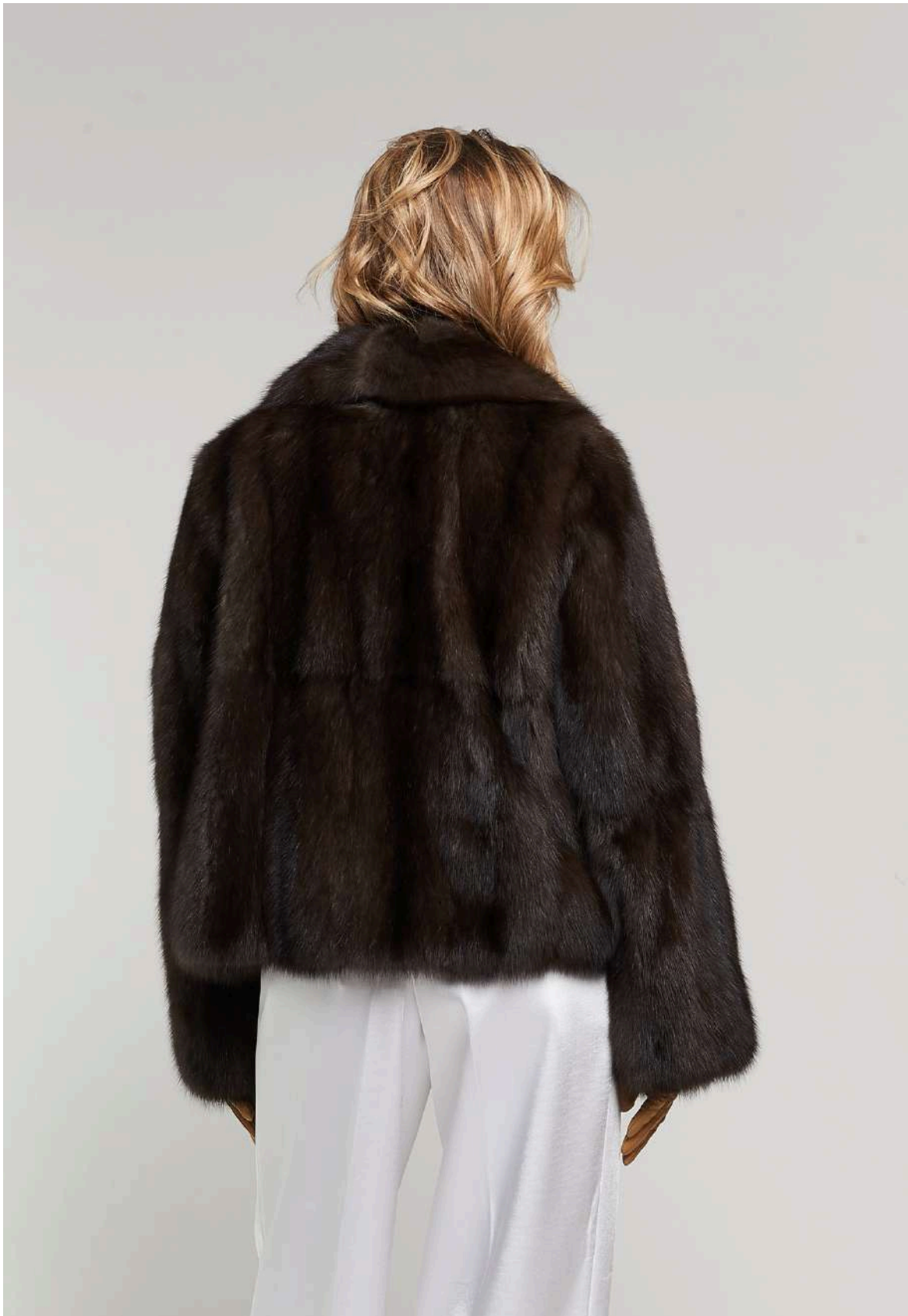
Rodio Russian Sable jacket Full skin vertical motif