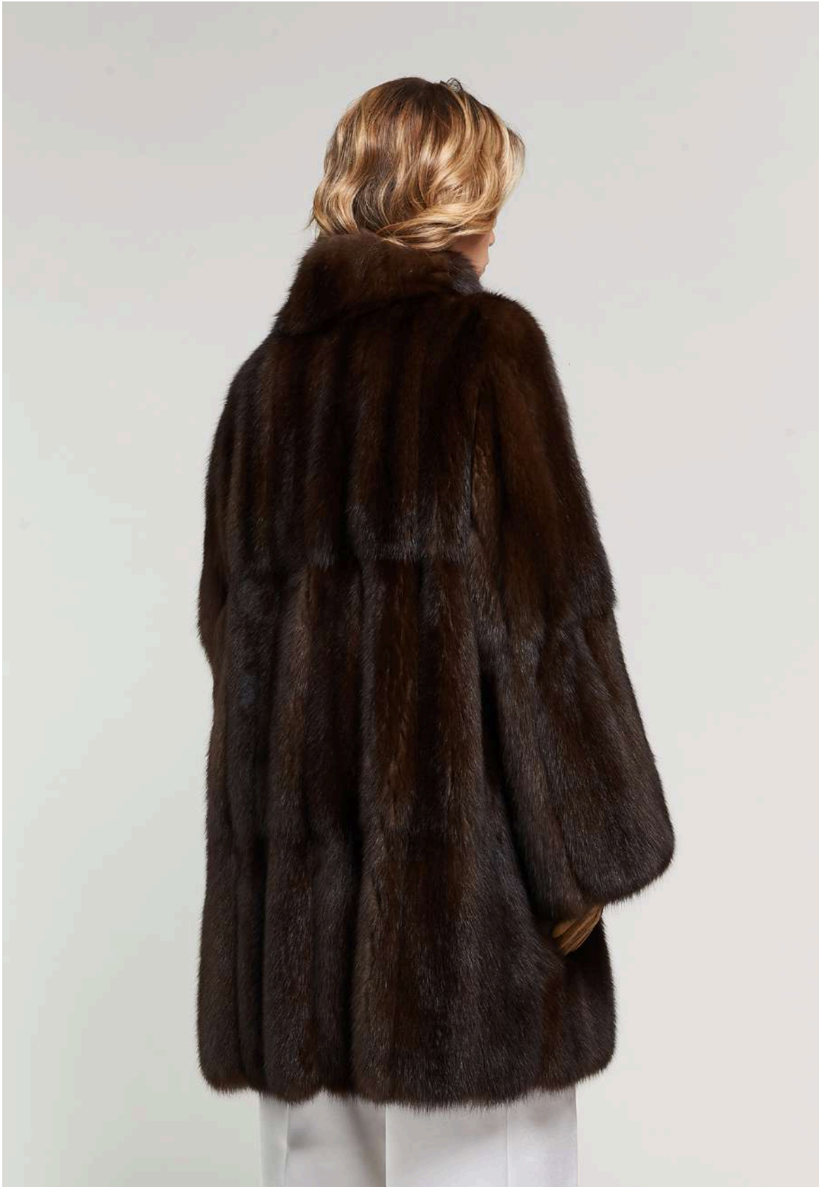
Dark Russian Sable jacket Vertical full skin motif