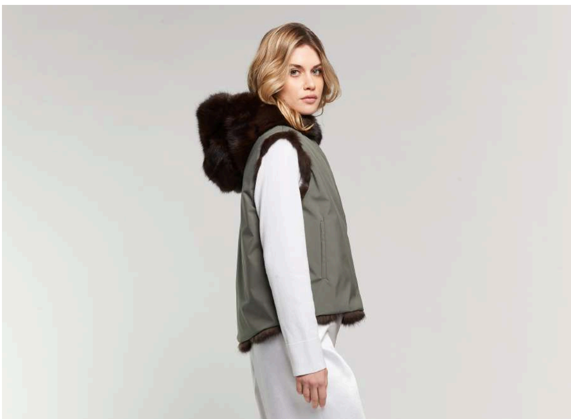
Reversible hooded vest Dark Russian Sable Diagonal motif