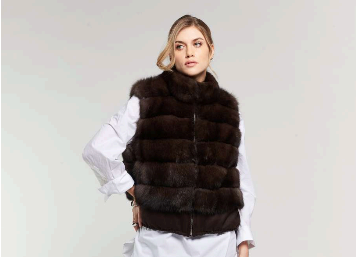
Antracite Silvery Russian Sable vest Horizontal motif Reversible in cashmere