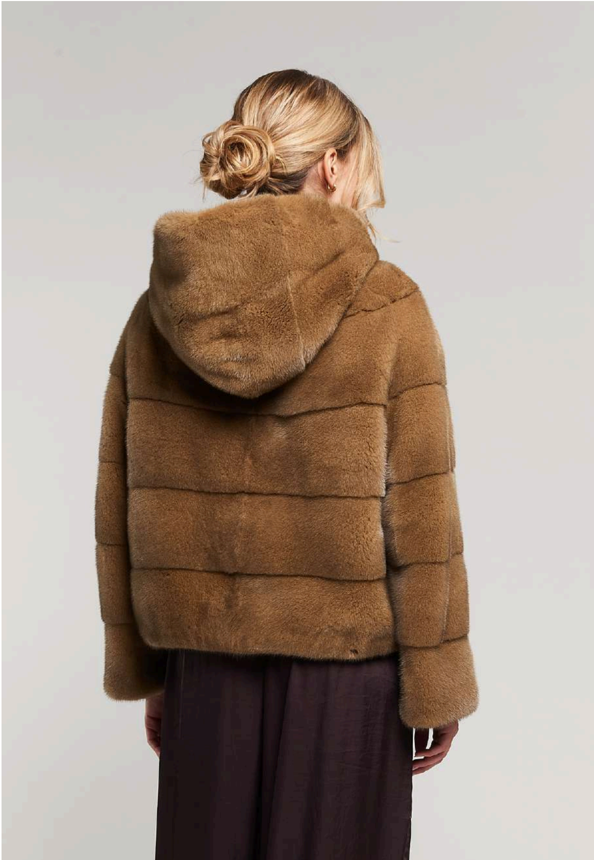
Salvia Mink jacket Horizontal motif