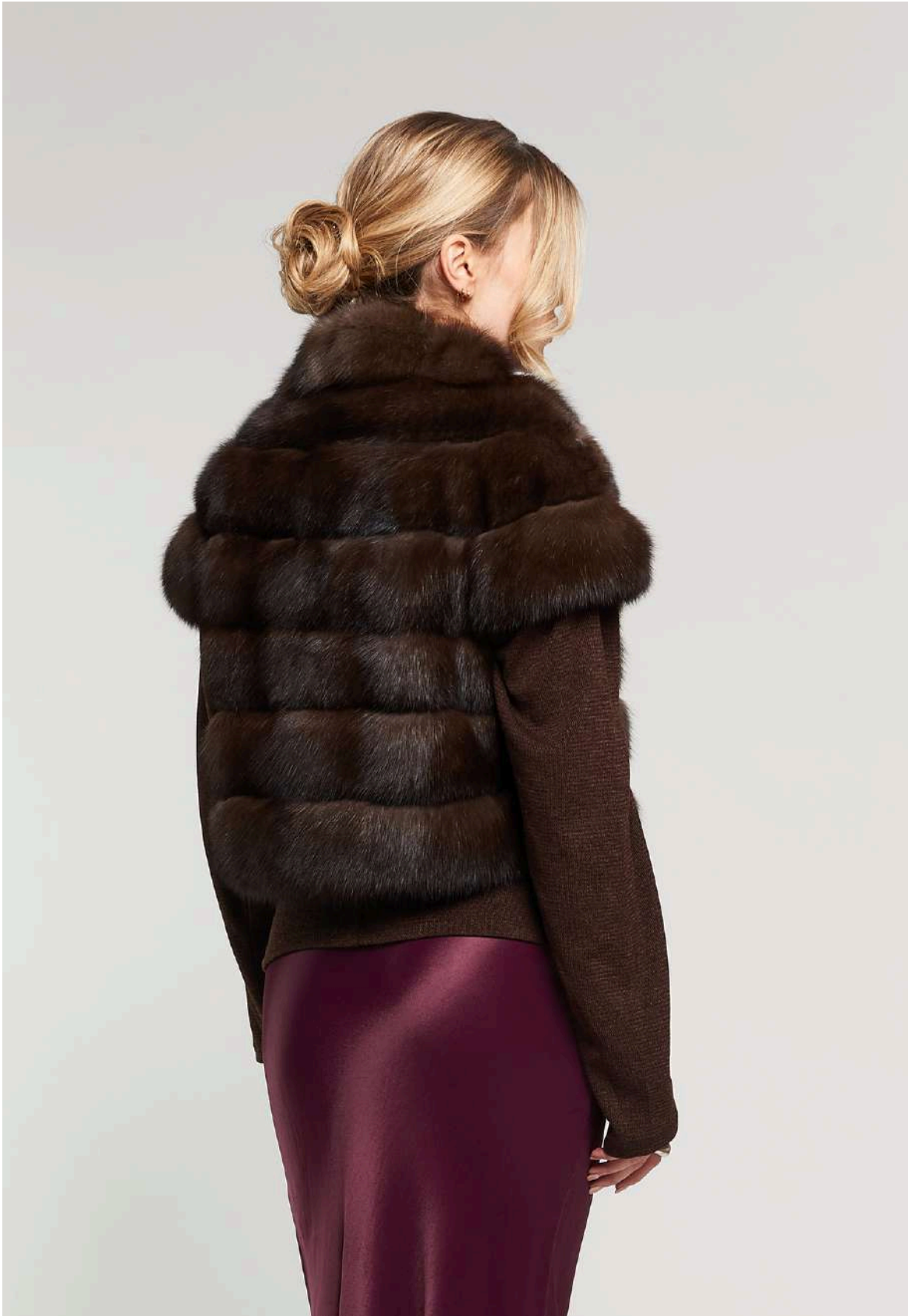
Dark Russian Sable vest Horizontal motif