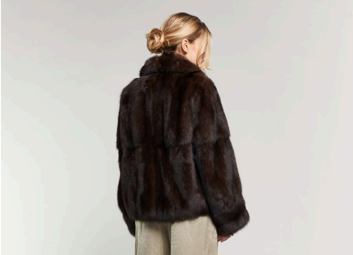
Dark Silvery Russian Sable jacket Vertical full skin motif