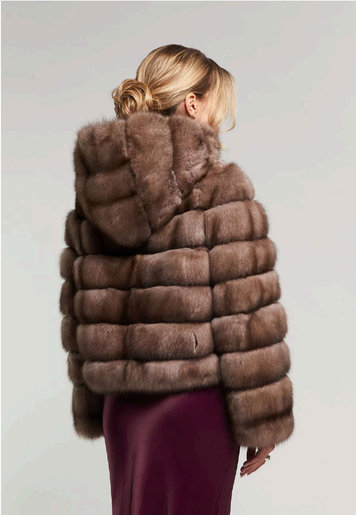
Lavender Russian Sable jacket Horizontal motif with hood