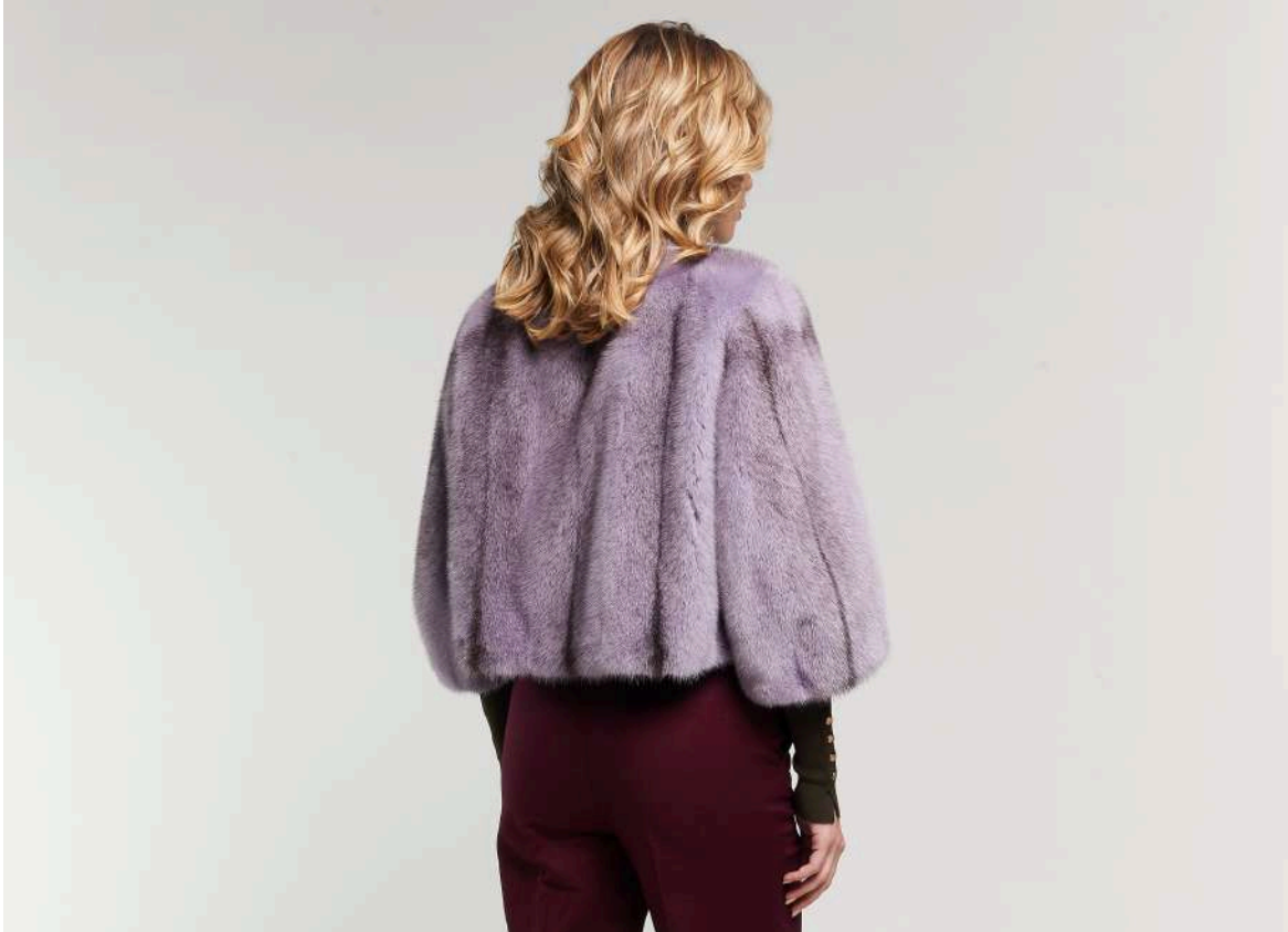
Purple Mink jacket Vertical motif