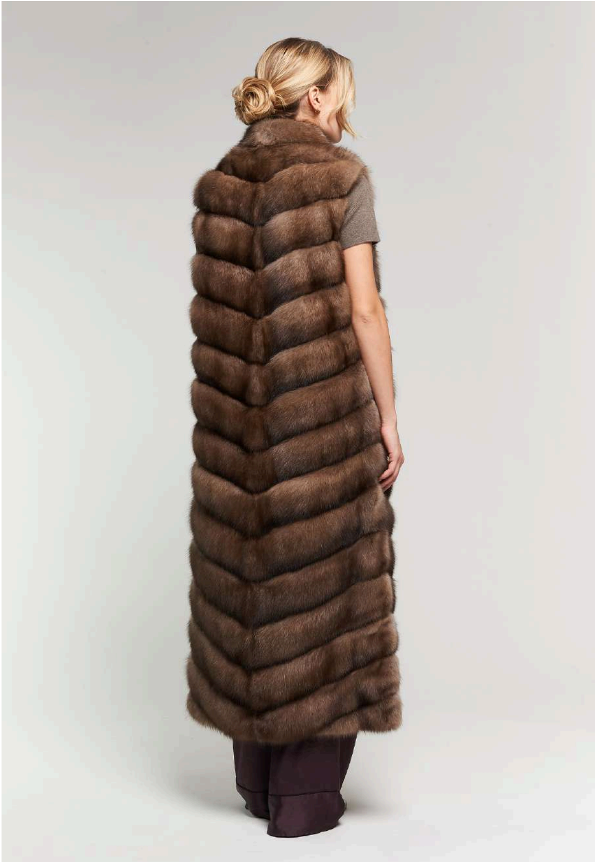
Lavender Russian Sable vest Diagonal motif