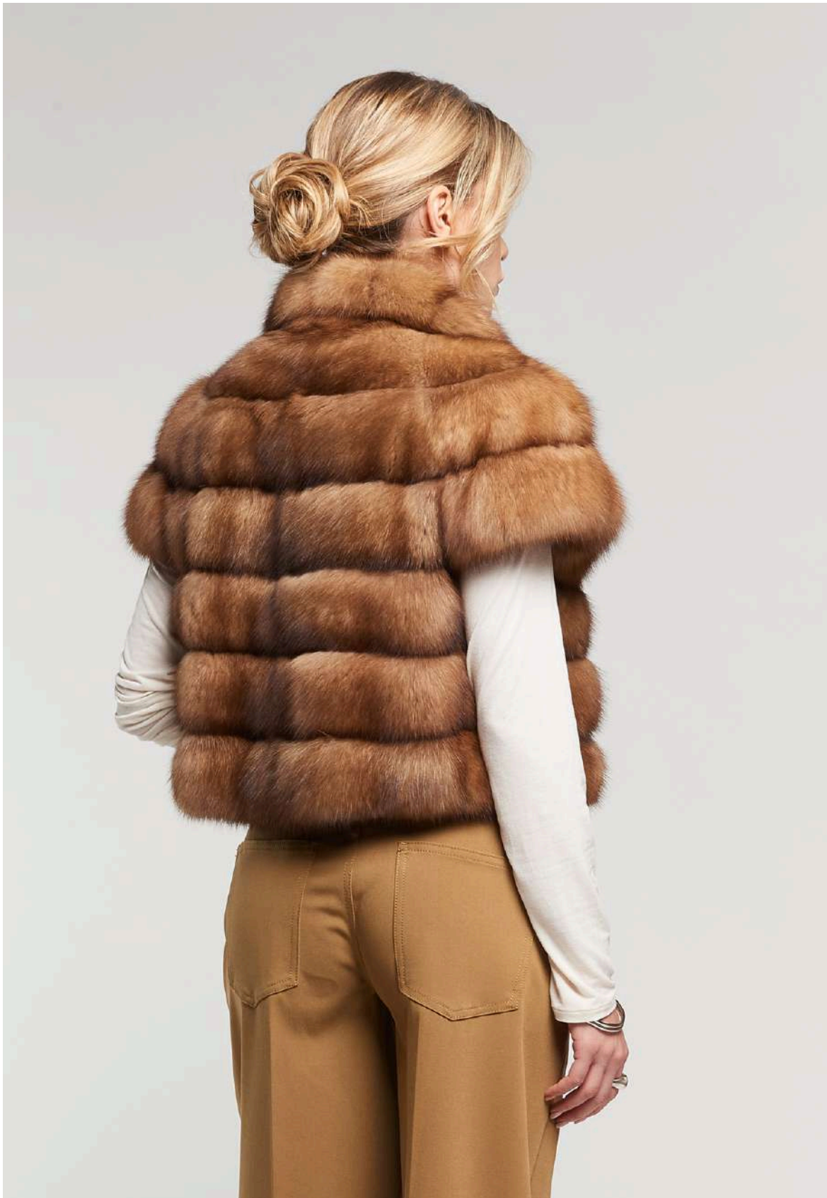
Golden Russian Sable vest Horizontal motif