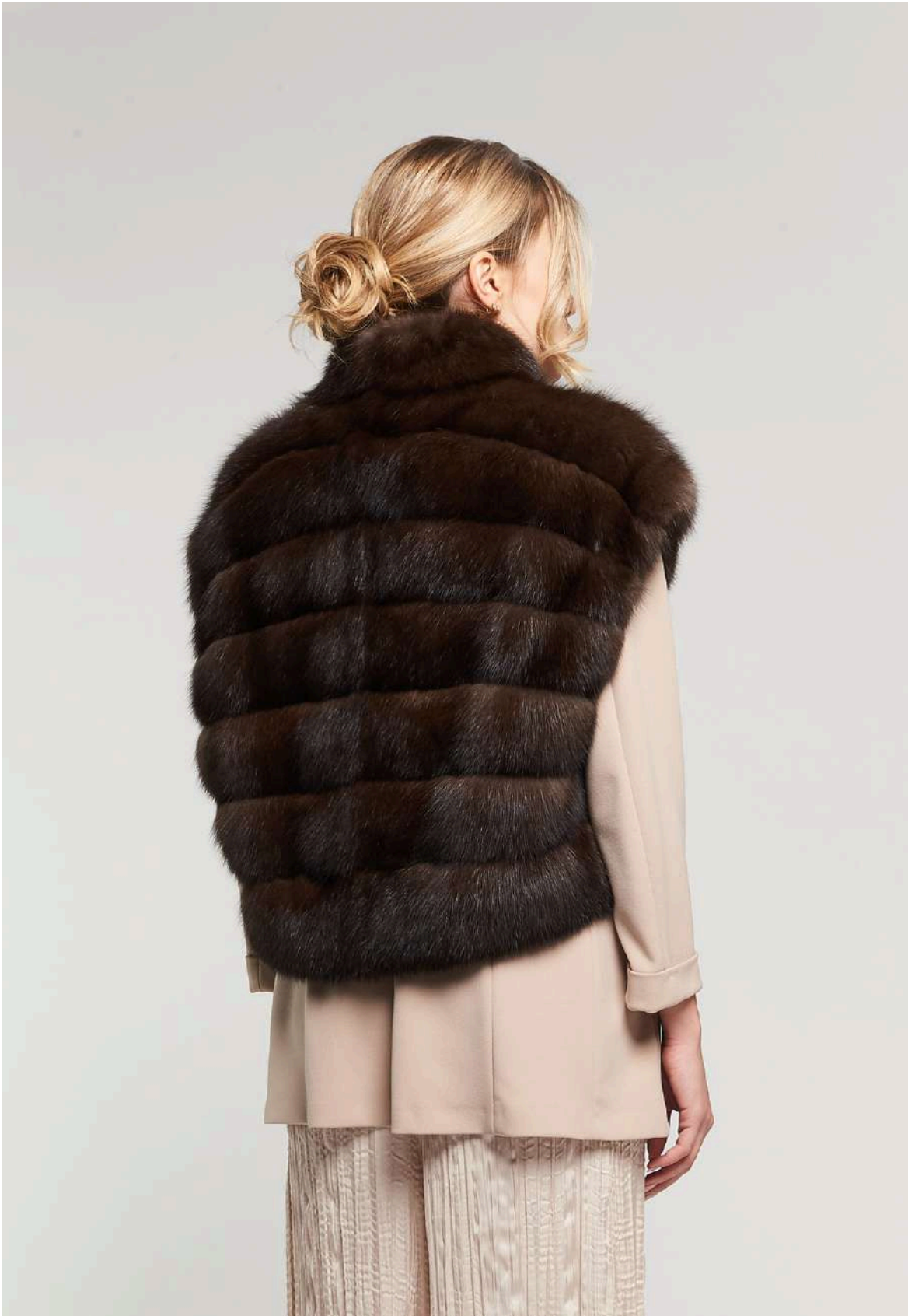
Dark Russian Sable vest Horizontal motif