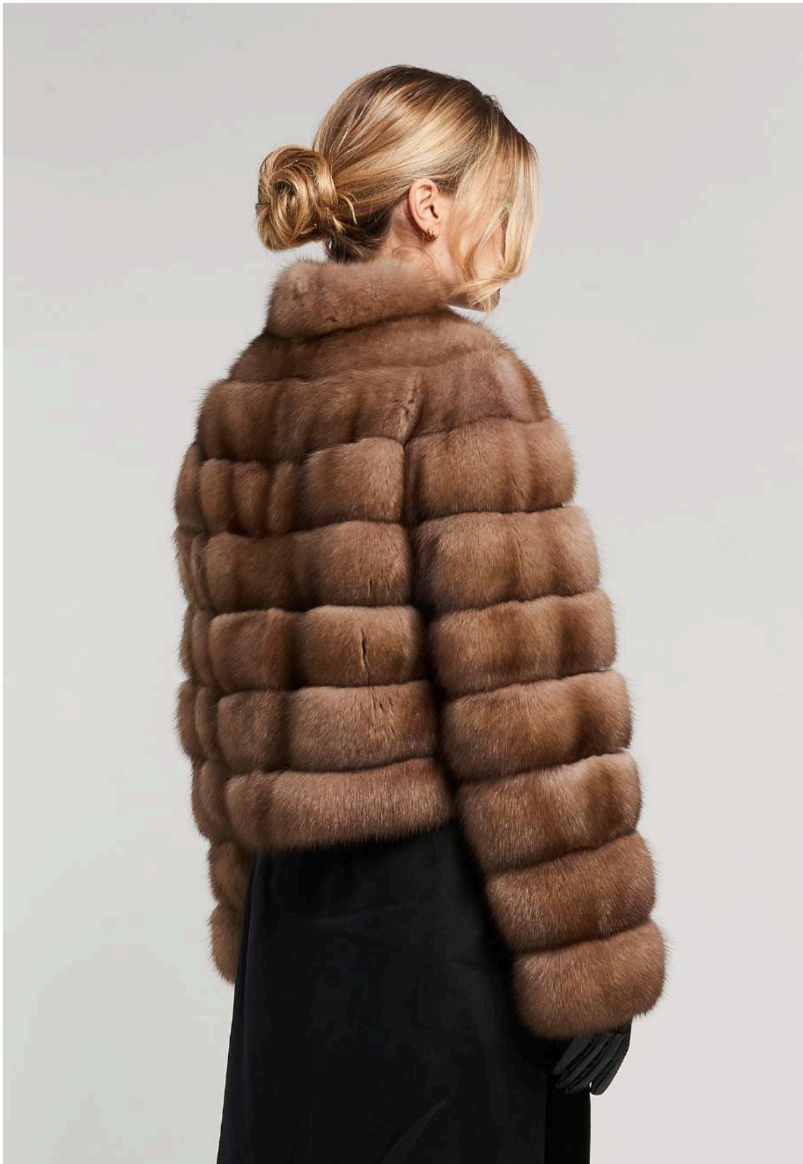
Lavender Canadian Sable jacket Horizontal motif