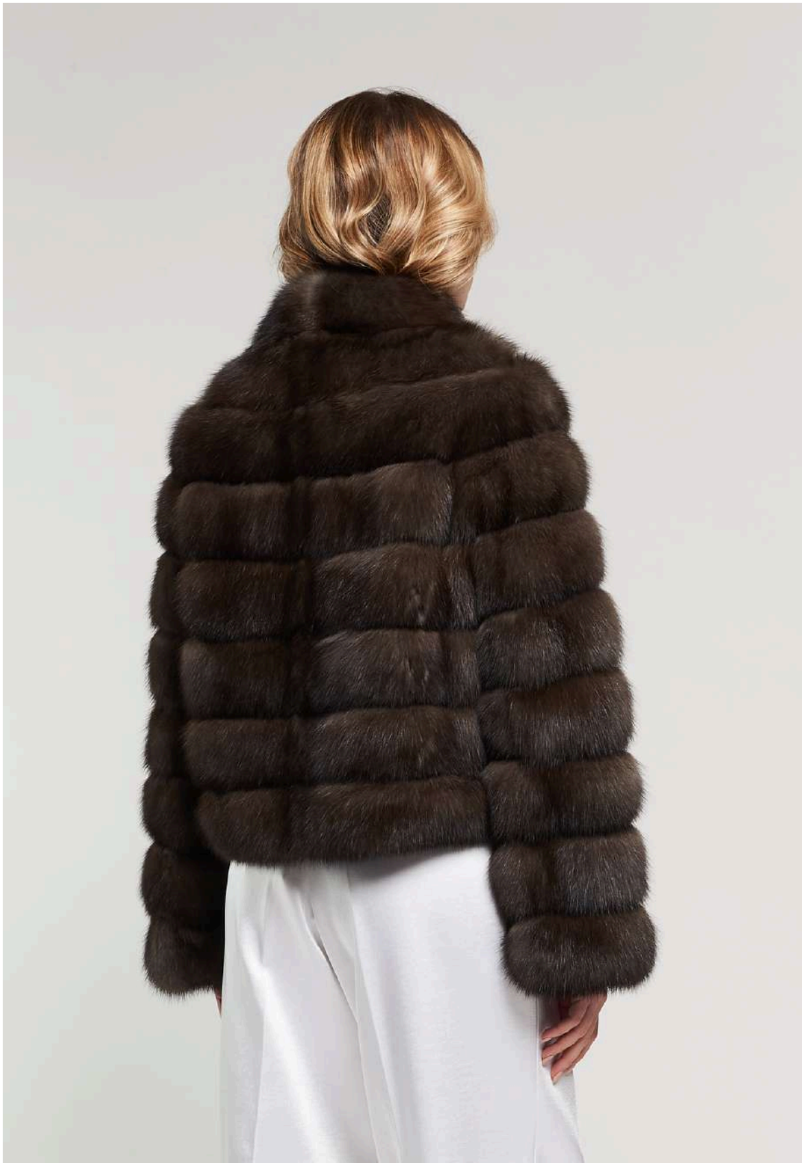
Antracite Russian Sable jacket Horizontal motif