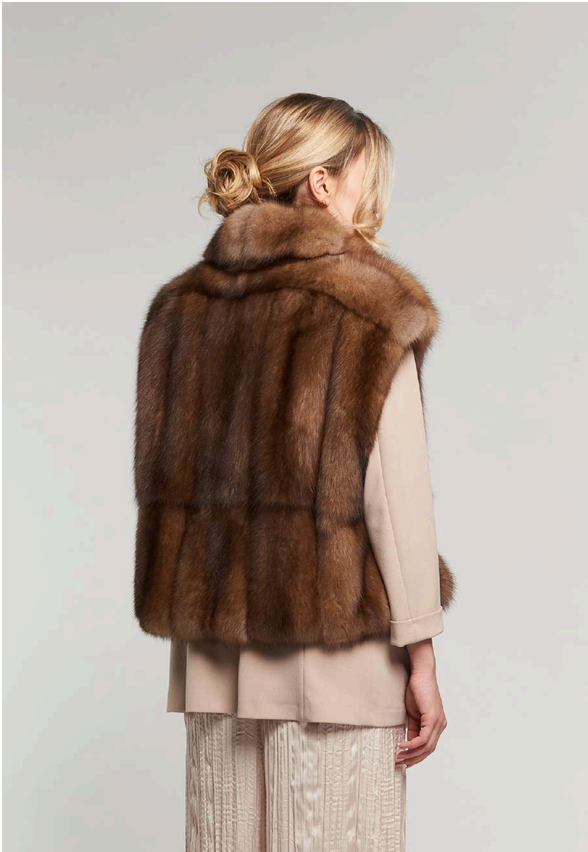
Tortora Russian Sable vest Vertical and horizontal motif