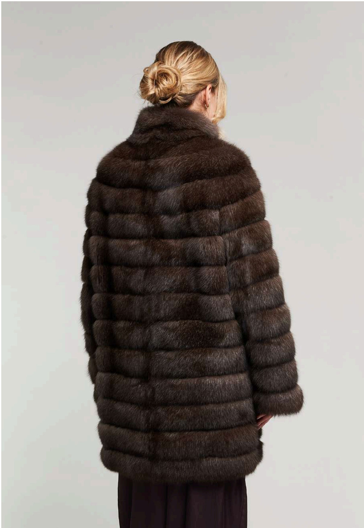
Dark Silvery Russian Sable jacket Horizontal motif