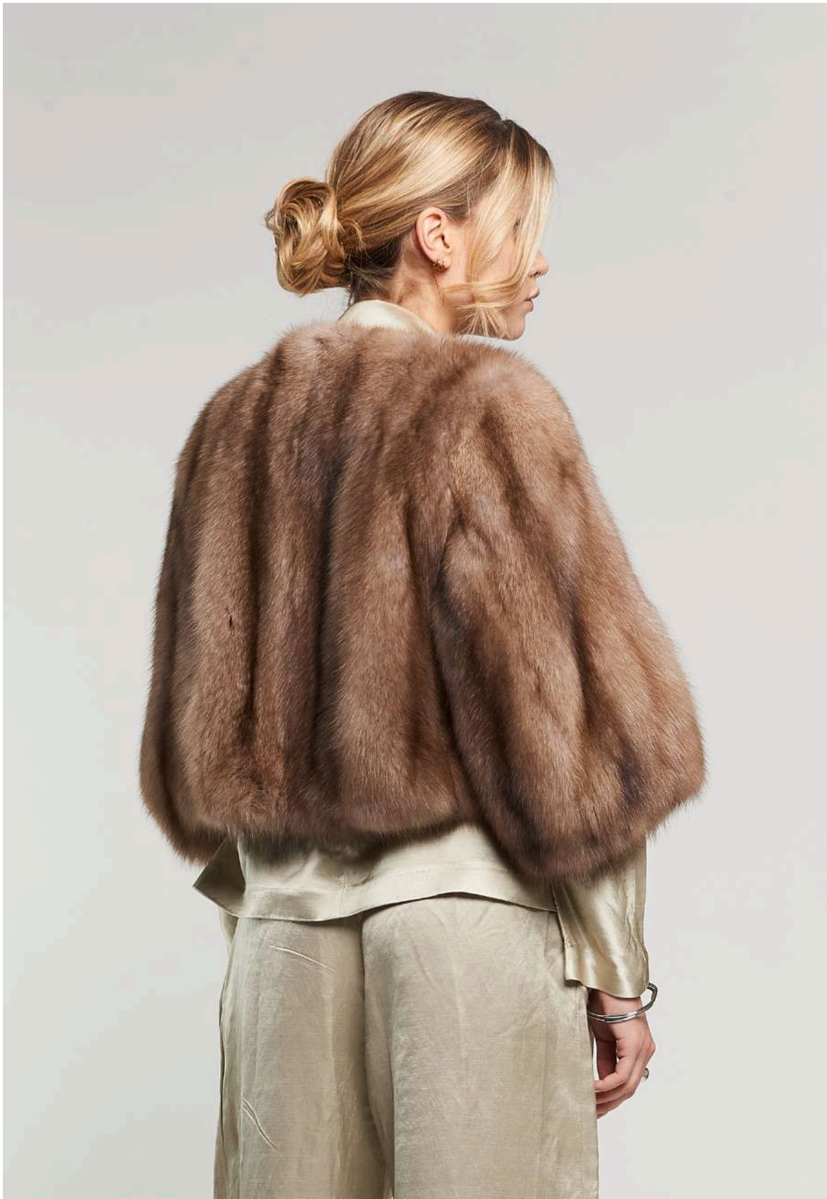
Lavender Russian Sable jacket Vertical full skin motif