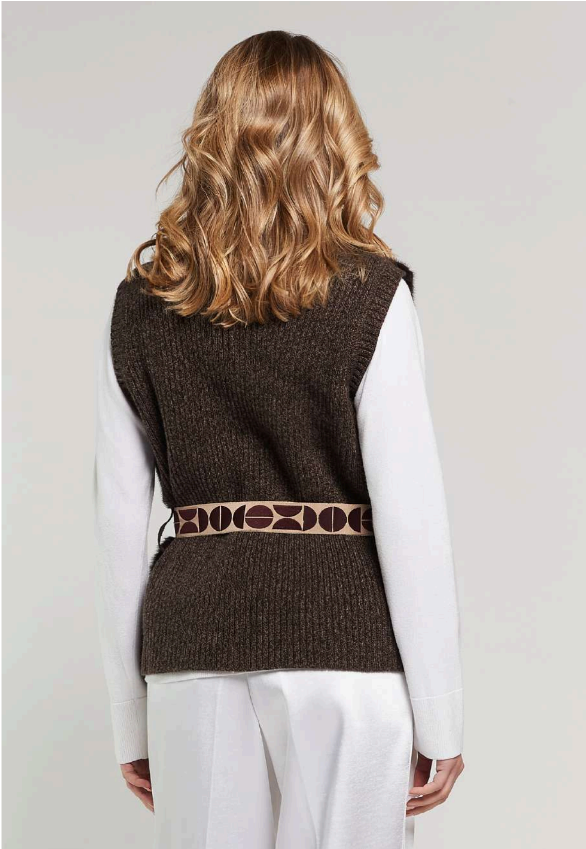
Dark Russian Sable vest Vertical full skin motif with Wool and Cashmere Knit on the back