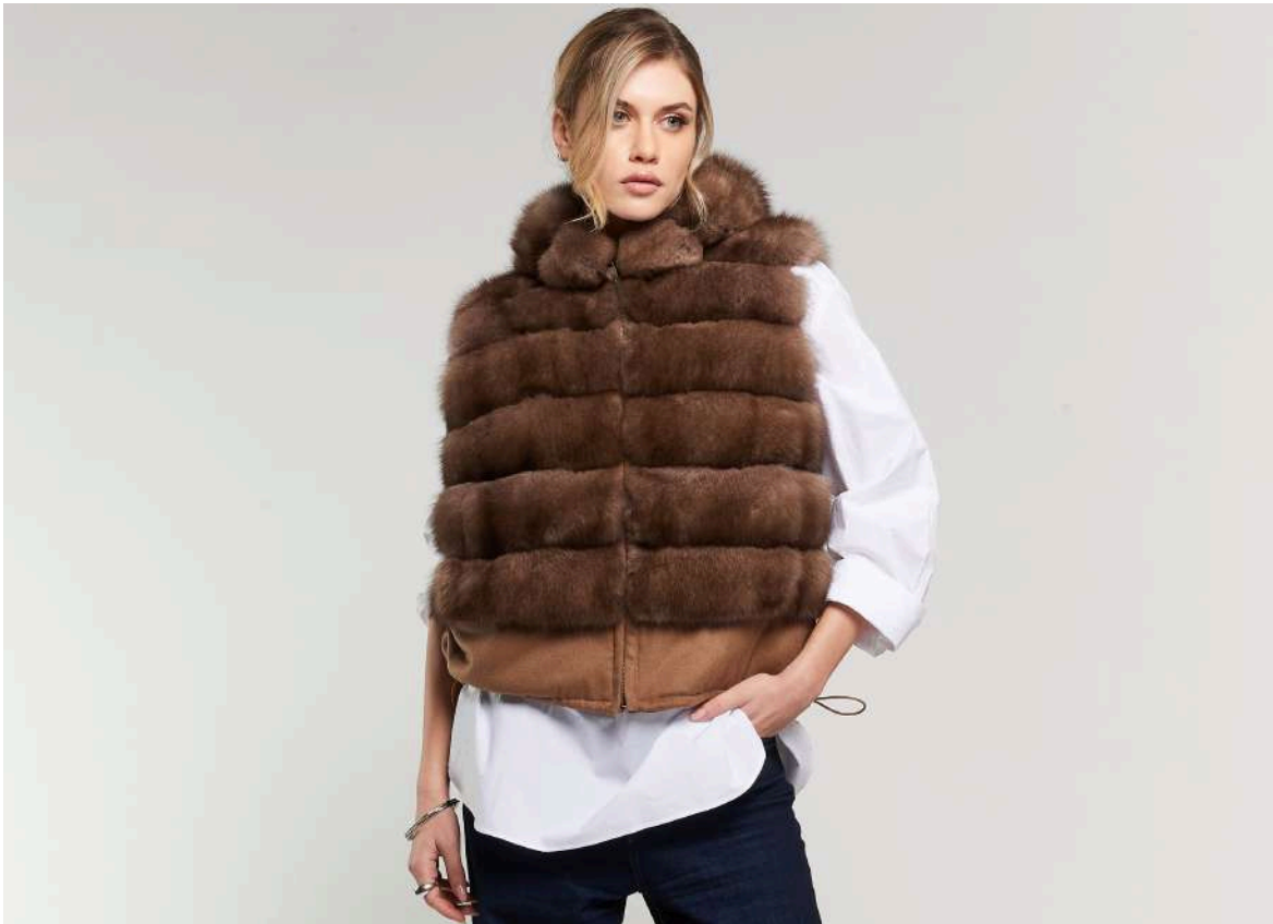
Lavender Russian Sable vest Horizontal motif with hood Reversible in cashmere