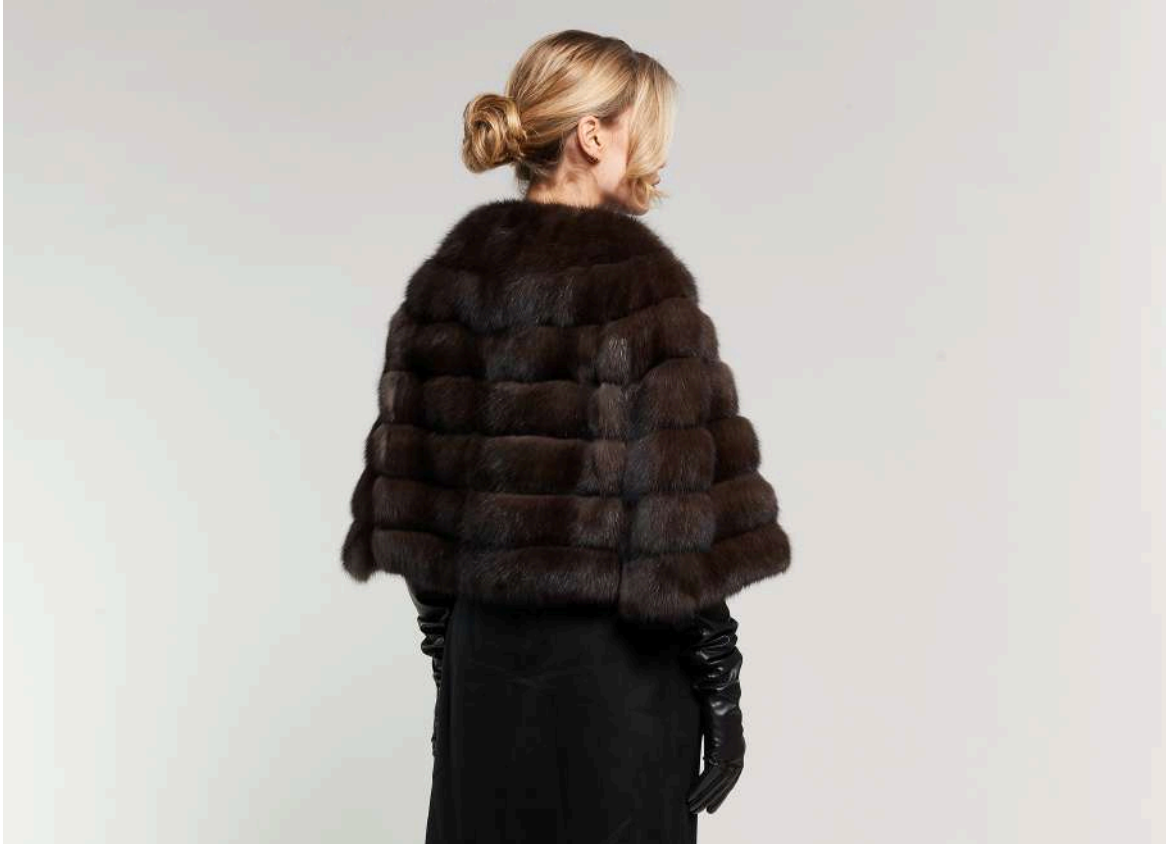
Antracite Russian Sable jacket Horizontal motif