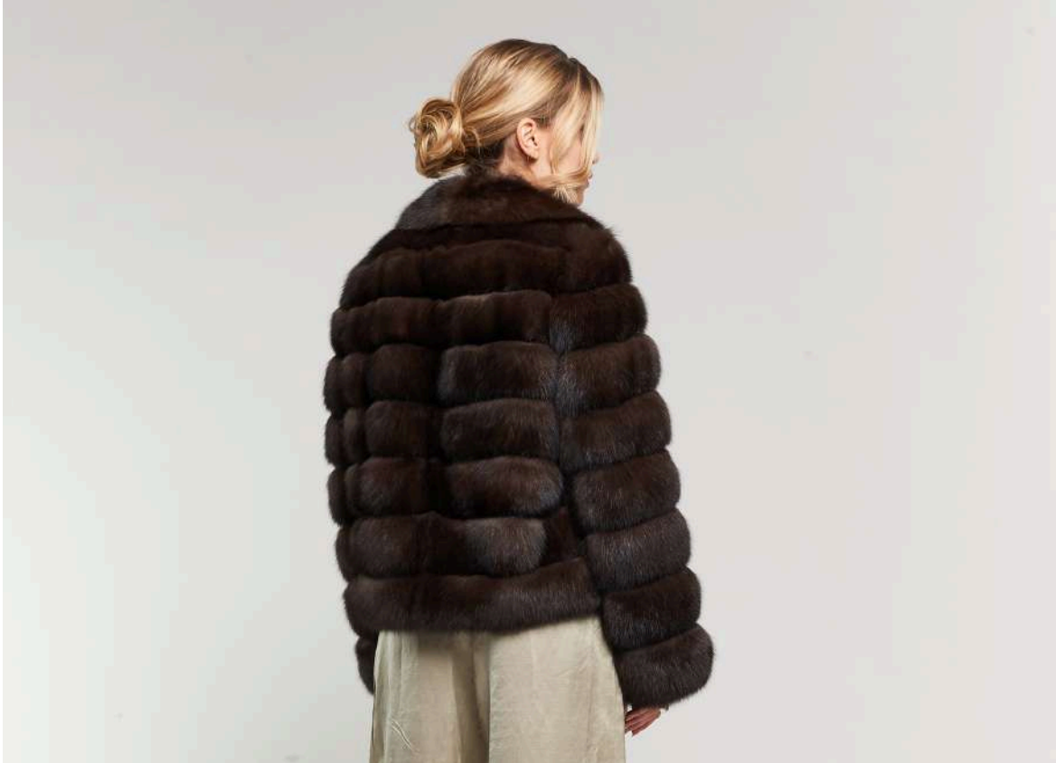
Antracite Russian Sable jacket Horizontal motif