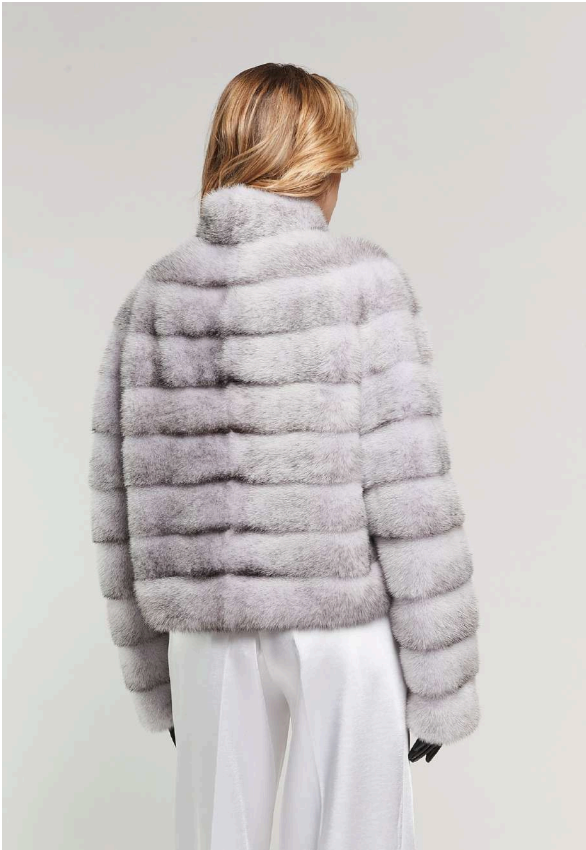
Grey Mink jacket Horizontal motif