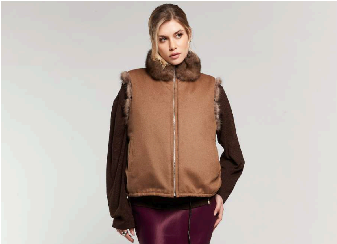
Lavender Russian Sable vest Horizontal motif Reversible in cashmere