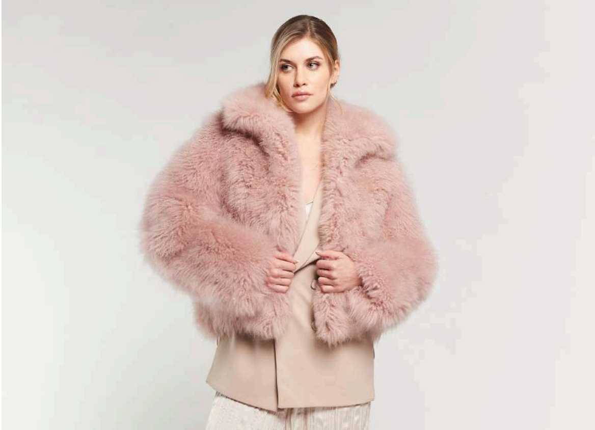
Pink Cashmere Lamb jacket